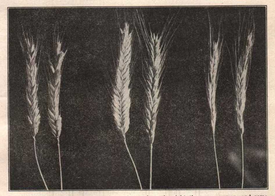
Figure I. Shows pure Rosen in the center, and on the right the pure common, and some crossed types on the left. Don't be misled by the large heads commonly found in crossed ryes. See how few kernels they often contain. The test of pure Rosen is the manner in which it fills four complete rows of grains on every head.

Rye does not belong on every farm, but it is particularly adapted to large areas of the lighter soils of this state. To prevent washing and leaching, these soils should not be permitted to go through the fall and winter without a growing crop of some kind. In nearly every case, the thirty-five to forty bushel yields of Rosen Rye have been obtained from fields sown during the first half of September. While it is far from our desire to advocate late sowing of rye, yet this crop can be used to advantage on thousands of Michigan acres to follow crops of corn and beans.