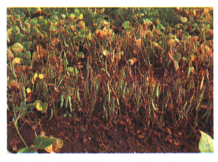
Fig. 1B—Defoliation resulting from rust in a Navy bean field in Saginaw County, 1974.

The results from the 1973 disease monitoring program (Table 1) illustrate the rapidity of rust disease development and spread under favorable conditions. These conditions include a susceptible host, presence of the pathogen, and favorable environment. Many plants were completely defoliated within two weeks after rust was first observed. In comparing the two seasons, it appeared that rust infection was much more critical to plant survival in 1973, a drought year, as compared to 1974, a non-drought year. This could be related to the presence of rust pustules on bean leaves, since the pustules provide an uncontrolled means for water to escape from the leaves. Hence, we would expect infected leaves on plants under a drought stress to wilt and fall off sooner than similarly infected leaves on plants under nondrought stress conditions.