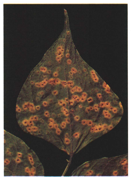
Fig. 1A—Urediospores (summer spores) are produced in rust-colored pustules on the leaves.

Eighty-nine bean fields in six major bean-producing counties were monitored for disease during the growing season in 1973. The findings are summarized in Table 1. Rust was reported in 30 percent of the fields the week of August 16. A week later, 72 percent of the fields had rusted plants. Twenty-five percent, or 22, of the fields had a very high incidence of rust accompanied by heavy defoliation and lower crop yields. In contrast to 1973, rust was observed on beans as early as July 30, 1974, and by the end of the season, 53 of 100 fields under observation had rust infection; vet in only two of the fields were the plants heavily defoliated.