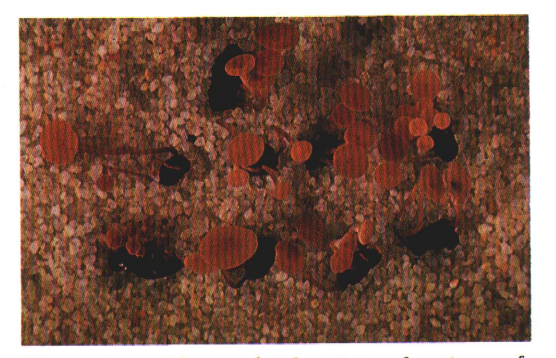
Figure 2. Apothecia of Sclerotinia sclerotiorum from germinated sclerotia.

ing or dead plant material, especially aging flowers. Occasionally, wounds caused by hail or cultivation are sites of infection. Infection of healthy pods, leaves and stems generally results from an infected flower that has fallen onto or come into contact with other plant tissues (Fig. 3). Shortly after infection, white masses of mold appear on the infected tissues (Fig. 4) and black sclerotia begin to form in these areas and within the stems thus completing the life cycle (Fig. 5). Secondary spread down rows occurs when infected plant tissues come into contact with healthy tissues.