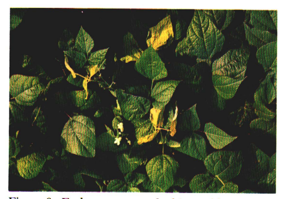
Figure 6. Early symptoms of white mold.