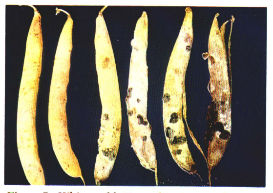
Figure 5. White mold. Note sclerotia on pods; control on left.