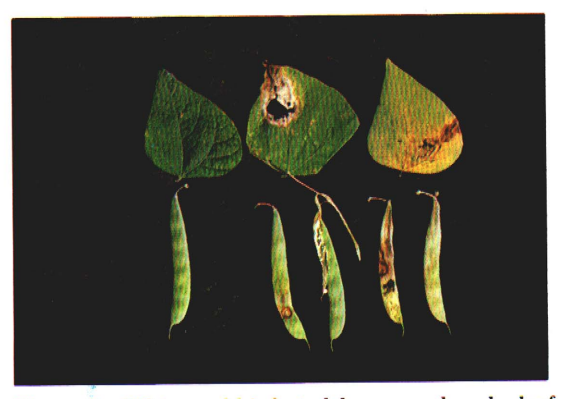
Figure 3. White-mold-infected leaves and pods; leaf infection resulted from an infected blossom that fell on the leaf.