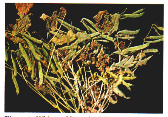
Figure 4. White mold on a bush bean. Note the dead leaves and stems.