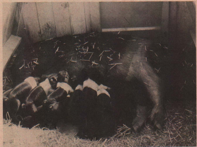
Portable farrowing house.

A crossbreeding program is recognized to be superior in raising feeder pigs or market hogs. Litter size, survival and growth rate are improved from 12 to 14% by multiple crossing (using 3 or more breeds) as compared to the average of the pure breeds used in the cross. Using three breeds in a rotational cross is preferred by most producers.