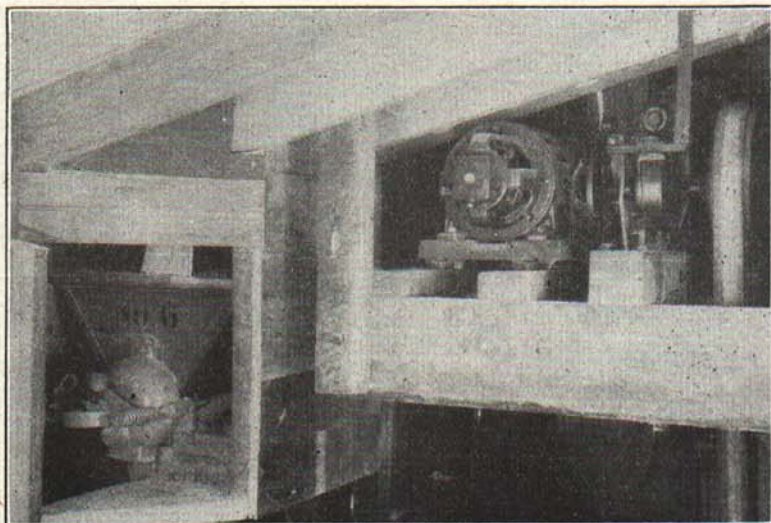
Fig. No. 2. One H. P. motor used to operate grain elevator (right) and six-inch buhr mill. Ground grain drops into feed bins in dairy barn.

Both these mills grind by friction, the grinding plates are kept in contact by springs when the mill is empty. If the mill should be run in this con-