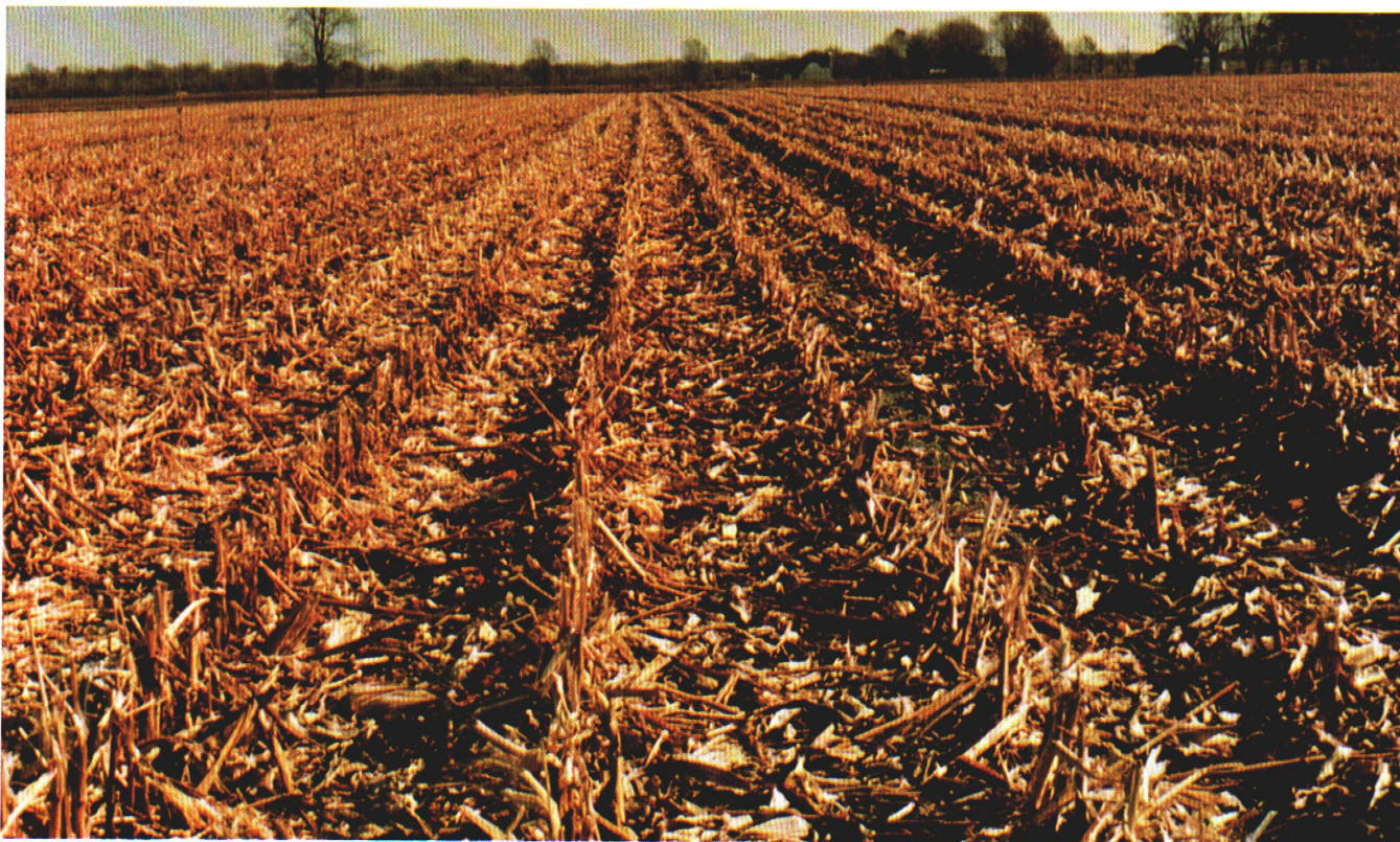
Figure 4. Irrigated corn with good yields can return over 5 tons of stover per acre. When returned to the soil, the residue greatly increases soil microbial activity and improves the soil organic matter.