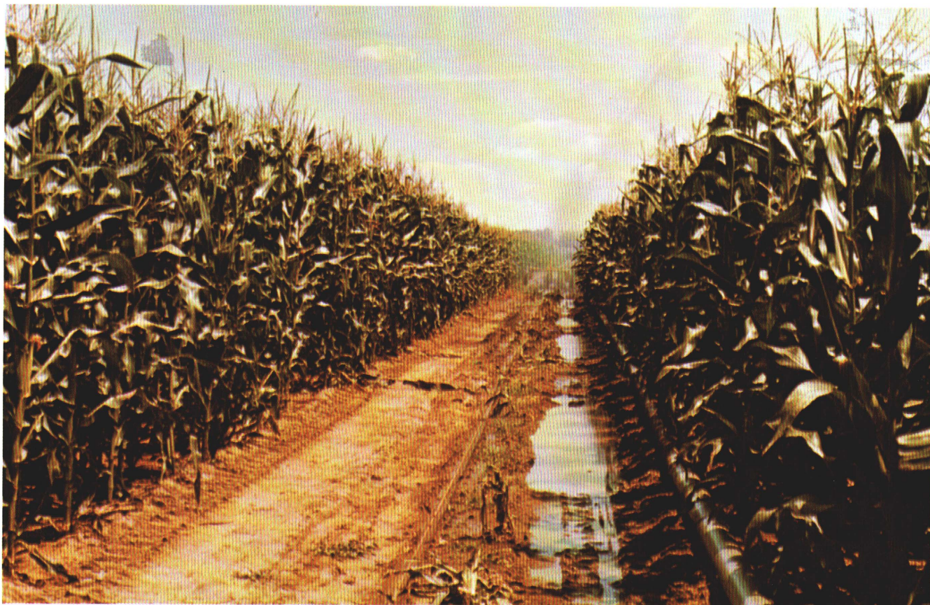
Figure 2. Ample nitrogen will give corn plants dark color. Note even lower leaves are green.

Front Cover: A good corn crop capable of reaching 200 bushels per acre. Do not look for "show ears." Top yields maximize the genetic, nutrition and light resources for the plant to make full ear development.