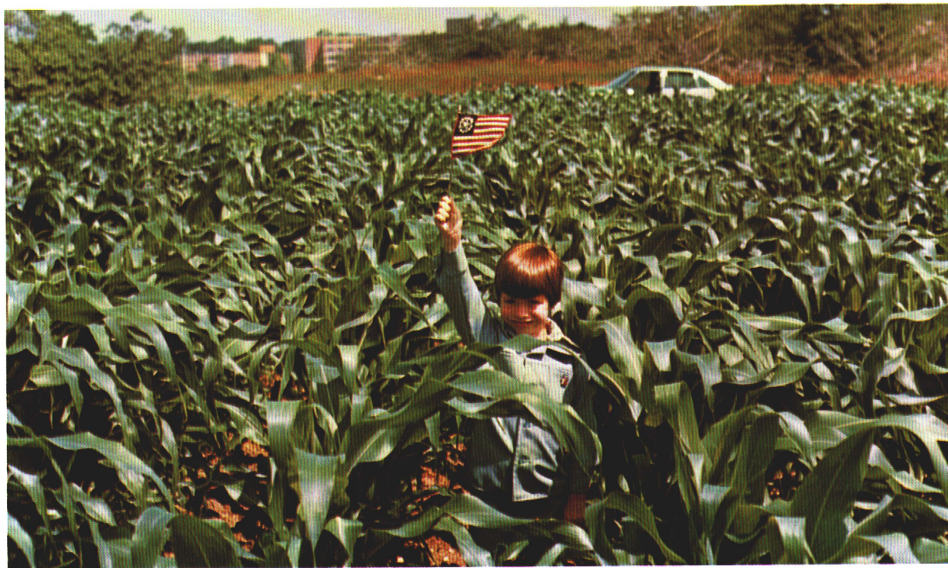
Figure 3. Corn should be waist high by July 4. At this stage, the crop starts using large amounts of nutrients and water.