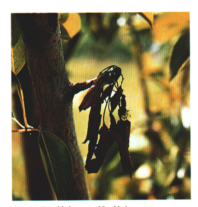
Figure 2. Spur blight stage of fire blight.

Bacteria enter the plant through blossoms, fresh wounds or natural openings, where they multiply and spread intercellularly. Blossoms and young fruit are often attacked (Fig. 2). At first, infected tissues appear dark green and water-soaked, but they soon shrivel or wilt, turning brown to black. Newly infected shoots wilt from the tip back towards the trunk, forming a "shepherd's crook" or bend at the tip (Fig. 3, page 4). The resulting shriveled leaves and fruit may remain on the tree long after normal defoliation has occurred. (For a complete illustration of the fire blight life cycle, see figure 4.)