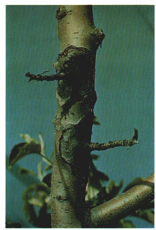
Figure 5. Fire blight canker on branch, note discolored bark and sunken margins.