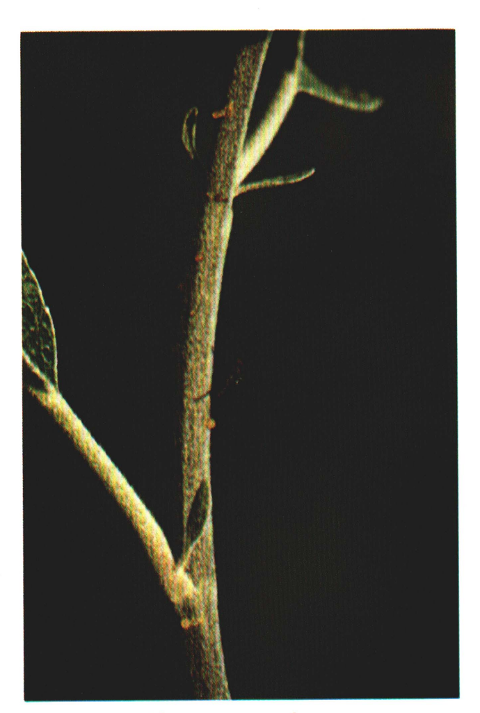
Figure 1. Bacterial ooze on a young shoot.

The bacteria are most active during warm, humid