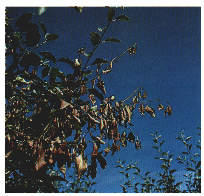
Figure 3. Wilting branches form a "shepherd's crook."