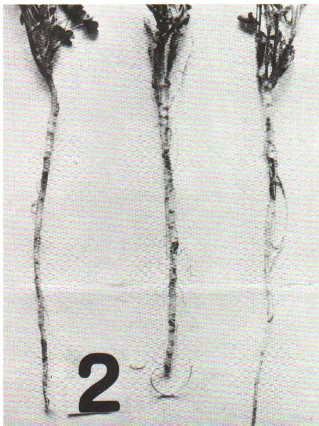
Shallow blackish lesions of Phytophthora root rot scattered on taproots.