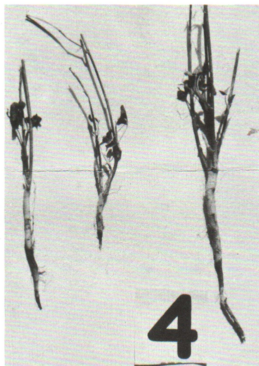
Taproots severely decayed by Phytophthora fungus. Such plants are subject to drouth and winter injury.