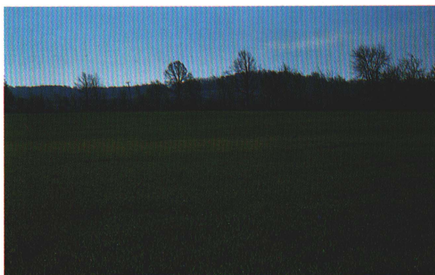
Fig. 1. Extensive yellowing of WSSMV infected wheat in a low area of a field. Yellowing will occur throughout an entire field when infection is severe and when spring temperatures remain cool.

WSSM symptoms usually develop uniformly over an entire field although wet areas in fields may have more severe symptoms (Fig. 1). Symptoms appear as yellow or light green dashes and streaks in mildly affected plants (Fig. 2) and as bright yellow-green mottling in more severely affected plants (Fig. 3). The dashes and streaks are oriented parallel to the leaf veins and taper at both ends to form spindles. Symptoms are first evident on lower leaves, and may develop on new growth under favorable conditions. Symptoms develop most rapidly between air temperatures of 48° and 55° F. When cool temperatures persist into late May and June, symptoms may appear on all leaves including the flag leaf. Under these conditions, the chlorotic spindles may coalesce into large non-