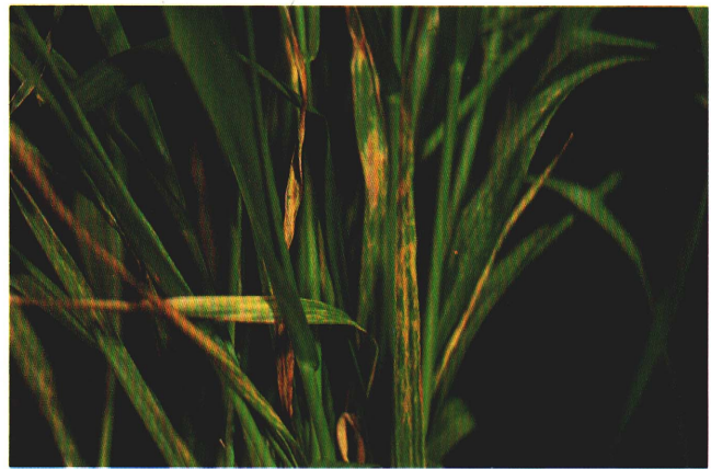
Fig. 4. Yellowing of all the leaves on WSSMV infected wheat plants occurs when cool temperatures extend into late May and early June.