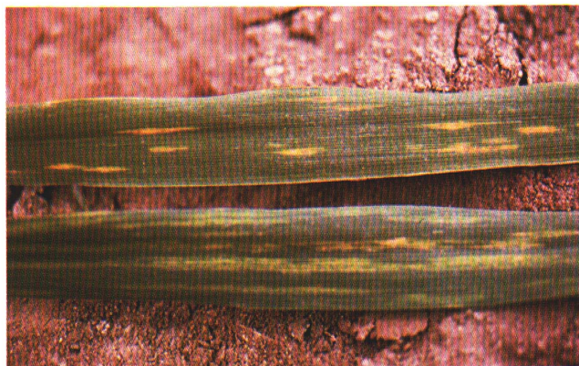
Fig. 2. Milder symptoms are seen as distinctive dashes or streaks in affected plants.

distinct mosaic patterns (Fig. 4). Very intense chlorotic areas may die and turn brown, often giving the appearance of Septoria leaf blotch. Stunting also occurs in infected plants, although it is usually mild.