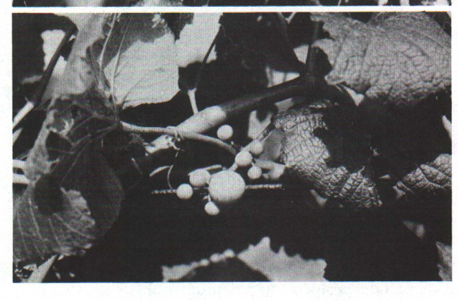
Figure 1. — Peach Rosette Mosaic Virus infection symptoms in 'Concord' grape. (Top) typical umbrella-like growth habit of an infected vine. (Middle) crooked short internodal growth and deformed leaves. (Bottom) berry cluster shelling and reduced vield.