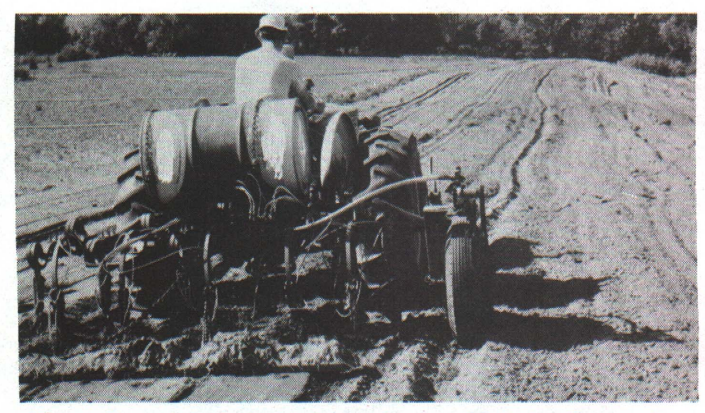
Figure 3. — A typical chisel type fumigant injector for use in pre-plant soil fumigation.