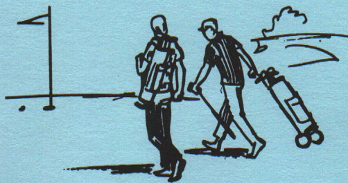
Fun For User.

The trap becomes one of deciding what measures are to be used to gauge success. Gross or net income or possibly net worth are generally used as indicators of success. Others argue that success can only justifiably be measured when