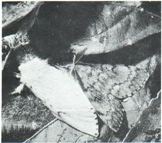
Figure 3. Adult female (left, white) and male (right, brown) Gypsy moth. Males seek out females by the sex odor (pheromone) emitted by the female. This pheromone has been chemically duplicated and is used to detect new infestations by baiting sticky traps with it to capture males.