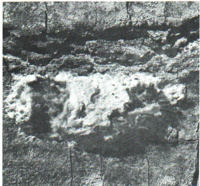
Figure 2. Gypsy moth egg mass with 1st stage larvae just hatching from the eggs. These small (less than 1/4") larvae are disseminated by wind and account for the major means of natural spread of the insect.

Use this bulletin as a descriptive guide to recognize the Gypsy moth and help prevent its further dissemination in Michigan and other lake states.