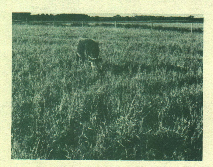
An undergrazed reed canarygrass pasture. At this stage it is particularly rank and unpalatable, U. P. Experiment Station, Chatham.

Pasture bloat is primarily a problem of livestock grazing lush, legume pasture. A pasture which contains legumes mixed with grasses (25-50%) greatly reduces the problem. Feeding hay to the animals before they are turned onto a legume pasture also reduces the hazard. In severe situations, hay can also be fed to cattle when they are on pasture, or a commercial bloat preventative used, to reduce the incidence of bloat.