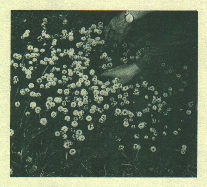
Volunteer wild white clover on a properly fertilized clay loam soil, Chippewa County.

The best way to establish the need for lime or any fertilizer element is through a soil test. The soil testing