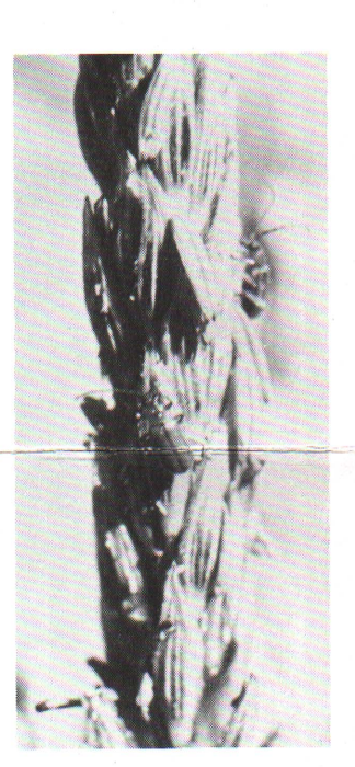
Figure 1. Northern corn rootworm adults feeding on a corn tassel. They are uniform yellow to green in color.

The western and northern corn rootworms are very similar in biology. Adult beetles of the rootworms emerge from the soil in late July and August. They are very active and hard to catch. They can be distinguished from nearly all other hard-shelled beetles found in flowering corn by their long antennae (feelers; see Figure 2). The beetles feed on the silks, tassels, soft kernels at the tips of the ears, and leaves of corn. (The western corn rootworm especially feeds on the leaves.) Their feeding on the early silks can result in a poor seed set. They lay their oval, yellowish eggs in the soil near the bases of corn plants. The adults are abundant in corn while it is flowering, and feed on the pollen of a number of plants when the corn matures. They are active in the field until the first hard frosts of the fall.