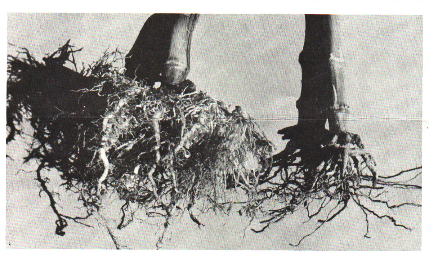
Figure 3. Roots on the right have been severely damaged by corn rootworm larvae; the roots on the left were protected from damage by an insecticide applied at planting time.