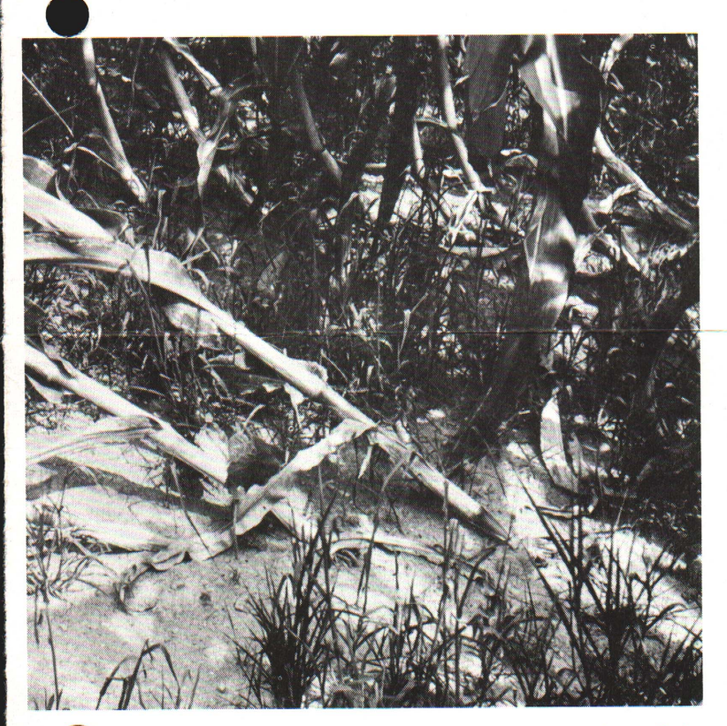
Figure 4. Lodging of corn caused by destruction of the roots by corn rootworm larvae. The stalks tilt right from soil level and often curve up (goose-neck) near their bases.

Rotation—rootworms can only be a pest where corn follows corn without rotation. The best way to control the rootworm is to rotate the corn with any other crop. Infested fields should be placed in rotation, unless there are real benefits from growing corn-after-corn in that particular field. The advantages of growing corn without rotation should be reviewed when problems develop with the corn rootworms.