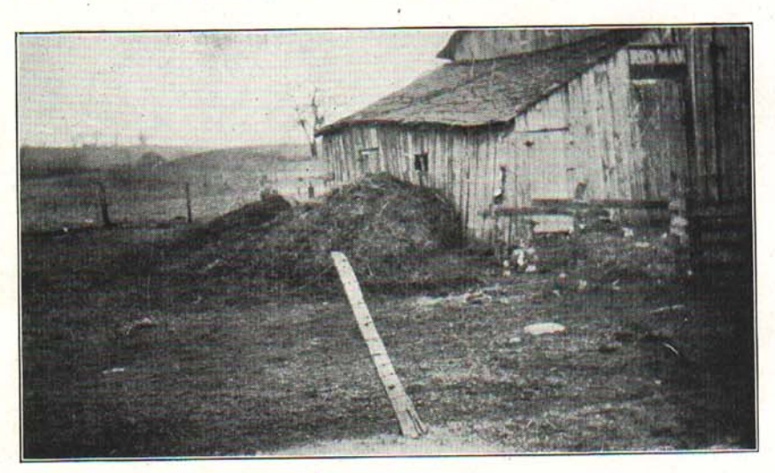
An expensive method of handling manure.

It is probably not necessary to discuss the loss occasioned by piling the manure under the eaves or by scattering it over the barnyard. In case it is not possible to construct a manure pit, the manure should be placed in a compact pile, with nearly straight sides, to keep it moist and well packed. Rail or board pens are often built in such a way that the live stock can keep the manure trampled. Horse and cow manure should be mixed in order to prevent "fire fanging" in the horse manure. The mixture can also be handled more easily.