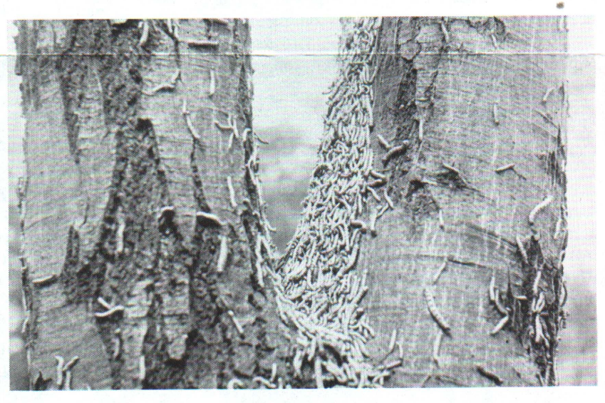
Fig. 2. Mass of redhumped oakworm larvae. In addition to stripping the foliage from trees and shrubs, larvae become a nuisance in towns and resorts as they wander about in search of food.