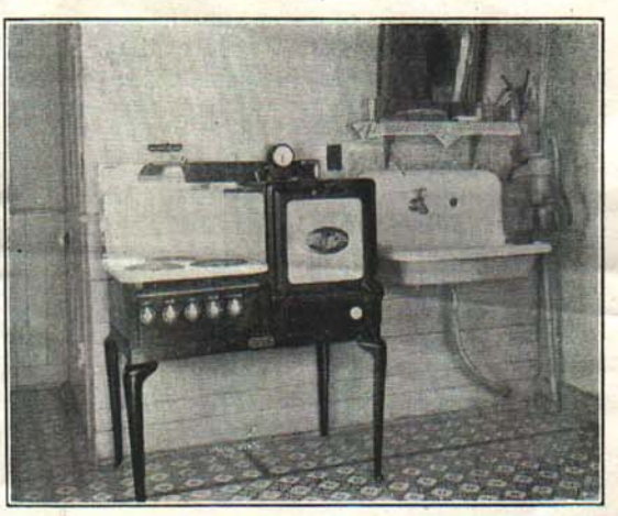
FIGURE No. 2

The switch above the sink controls the motor in the upper cut when pumping water at the house. The faucet was merely added for appearance and is always left open.