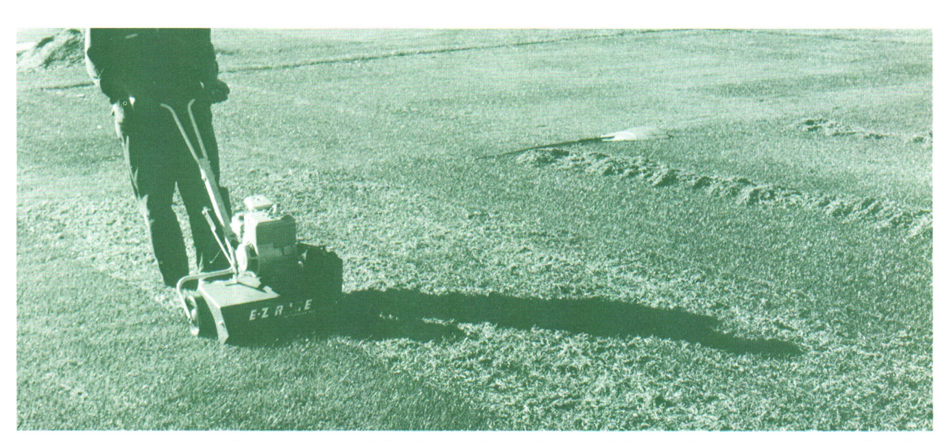
Thatch removal is best accomplished by using a de-thatching machine with vertical knives or tines. A de-thatching machine does a more thorough job than hand raking.

Turfgrass quality can be enhanced by improving the environment under the tree canopy. Pruning lower limbs and selectively pruning limbs in the upper crown will increase light penetration and air movement through the tree canopy. Also, pruning shallow tree roots will reduce competition for water and nutrients. If the tree is fertilized, it should be through deep-root feeding to avoid excessive surface fertilization and resultant injury to the red fescue. Fallen leaves should be raked and removed regularly during the fall to