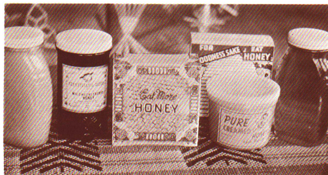
Honey prepared for sale in different forms.

It is very important that honey is not overheated at any stage of processing. Overheating drives off the natural, volatile flavors which make honey a unique product and chemically breaks down the levulose sugar. This darkens honey and gives it an off flavor.