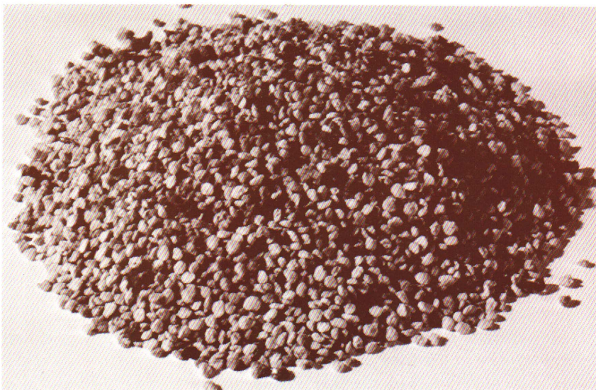
Pollen pellets trapped from bees (actual size).