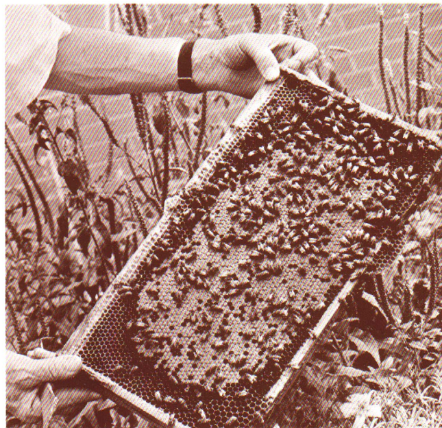
A solid patch of brood—indication of a good queen.

Well managed colonies usually produce a crop of honey. Poorly managed colonies often yield no surplus, and sometimes fail to survive. Some easy rules-of-thumb can help the beginner manage colonies. Increased knowledge of bee behavior and the yearly cycle of activities will enable the beekeeper to determine what needs to be done with a glance into a hive. Some management suggestions follow.