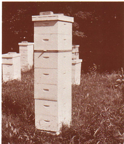
The result of good management.

Feeding pollen supplement to colonies about mid-March appears to increase early spring brood rearing and subsequent colony strength. Feeding pollen supplement in early August may also boost fall brood rearing, providing larger numbers of young bees for successful wintering. Pollen may be trapped and collected from colonies during the active season and stored for later use. Several types of traps are available.