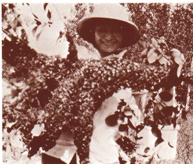
Capturing a swarm.

Swarming is the honey bee's natural method of reproducing the colony by splitting into two parts, one of which leaves the hive. Before swarming, colonies rear new queens in easily-observed, peanut-shaped cells. The old queen leaves with about half the bees and a young queen replaces her in the original hive. The first swarm which leaves the hive (prime swarm) clusters nearby on the branch of a tree or some suitable object and should be retrieved and installed in an empty hive. If the swarm is not retrieved, it will be directed by scout bees to a new location such as a hollow tree or inside the wall of a house. Swarming activity is most common from late May to early July.