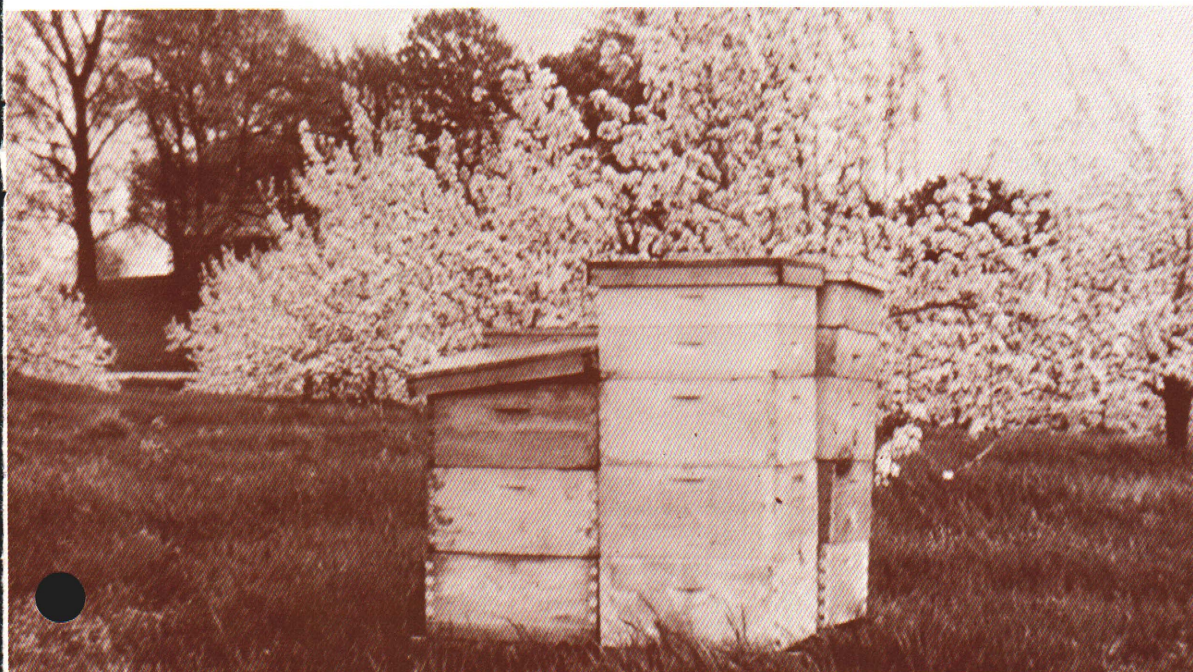
Bees in a fruit orchard.

A pollination specialist, particularly in fruit, must be acquainted with the grower's spray schedule. There should be an understanding between the beekeeper and the grower that insecticides will not be used during the bloom period to minimize spray damage to the bees. A brief, written contract can avoid misunderstandings. Check with your state association for suggested minimum charges.