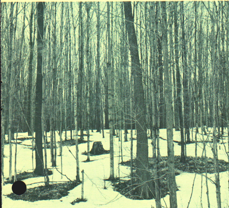
Figure 2 — Over-stocked young (thicket) stand. Blue ribbon crop trees should be selected and others (crooked, defective, and low-valued species) removed or killed with herbicides.

Unless measures are taken to correct deformed or injured seedlings, the value of such trees at maturity may be greatly reduced. Heavy grass and weed growth also provide ideal winter cover for destructive rodents such as mice and rabbits.