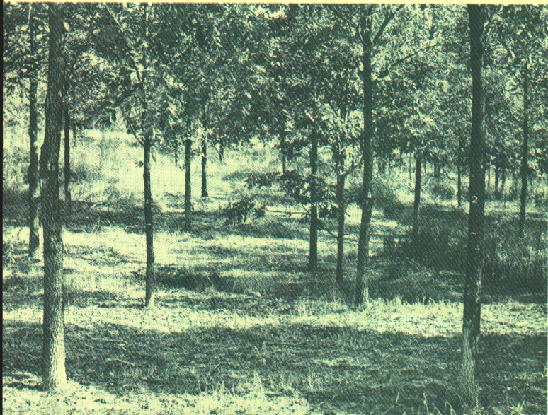
Figure 8 — With adequate weed control, this Blue Ribbon plantation is getting maximum use of available soil nutrients and moisture, yet the site is protected from surface run-off and severe erosion. Any plant food added will be available to the trees and not wasted on grass and weeds.

Precise fertilizer formulations are difficult to recommend for trees. A good rule of thumb for quality hardwoods is maintenance of a level of available nutrients similar to that recommended for corn on the particular soil type. Soil testing of old farm fields now in tree production is useful, but this becomes much more difficult in natural forest stands and is generally not recommended. Although nitrogen is the element most likely to give the greatest response, it is better to use a balanced fertilizer with a NPK ratio of 2-1-1, such as 16-8-8. Applications of less than 100 pounds of nitrogen per acre will probably be of little value. For trees that show severe yellowing, applications of at