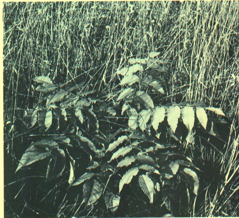
Figure 3 — Black walnut seedling growing in competition with heavy grass and weed growth. Grasses and weeds rob the young tree of moisture and plant nutrients.

Soil textures cover a wide range of particle sizes from coarse to fine. Coarse textured soils such as those of a sandy or gravelly nature generally contain