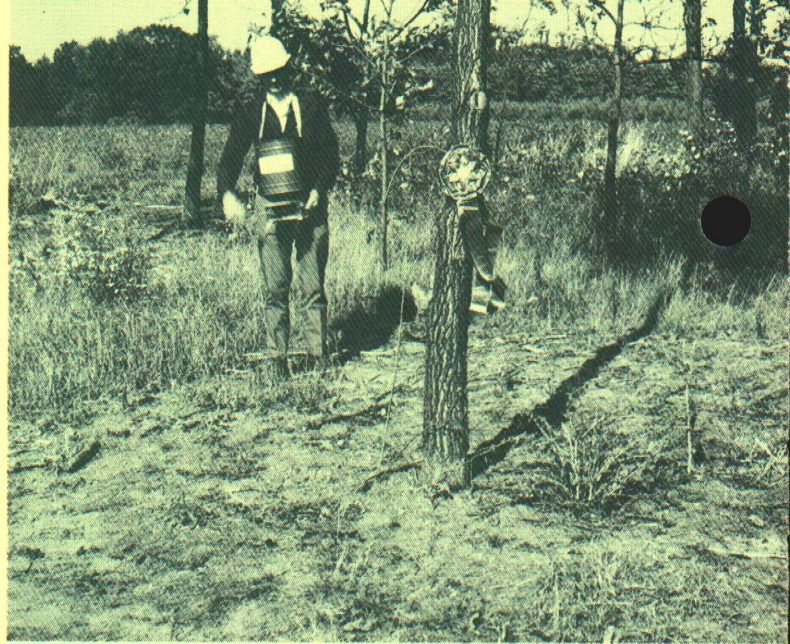
Figure 9 — Fertilizer placement can be easily controlled by hand spreader. Note excellent weed control in circular pattern in the root feeding area of this tree.

Climate and the inherent fertility of the soil largely determine the kind of trees present and their growth pattern under natural forest conditions. Where natural stands of quality hardwood trees are found, the soils are usually highly productive. In the absence of recent destructive fire or heavy grazing, it is unlikely that supplemental additions of plant nutrients will greatly improve tree growth.