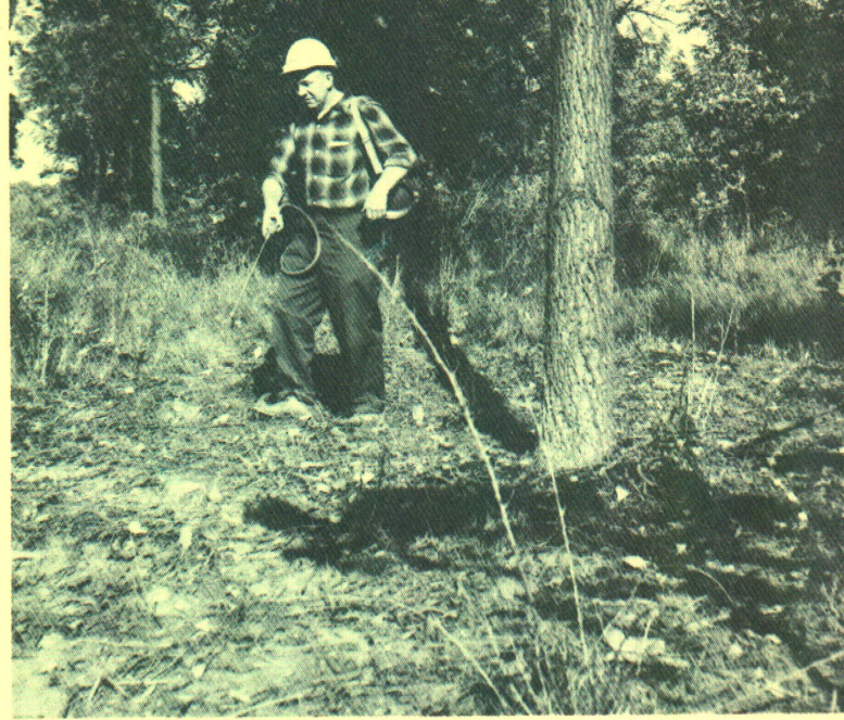
Figure 6 and 7 — Pelletized or granular herbicides can best be applied around individual trees with a hand-operated spreader (left). Back-pack sprayer application of liquid chemicals is recommended for herbicides spread in liquid form and when foliar contact is desired (right). More uniform spreading and precise control are usually attained with liquid application.