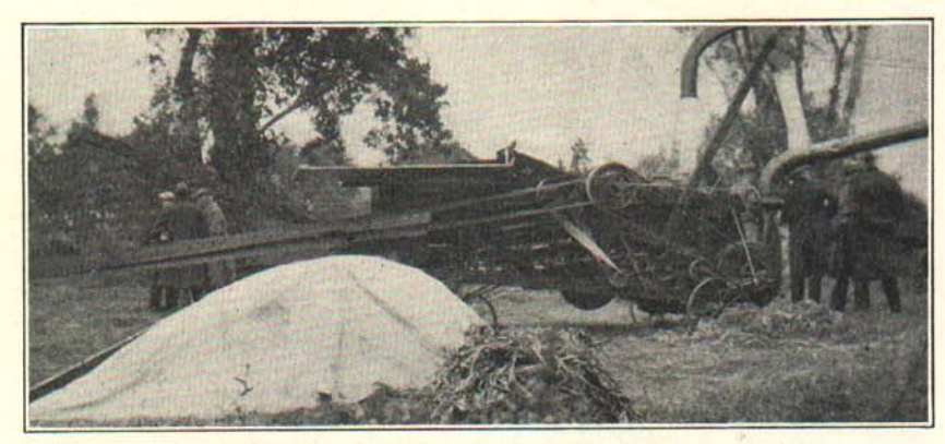
Fig. 2. Well Shredded Fodder Is Safe.

fields each year. This practice combines with the weather and natural corn borer enemies such as insects, parasites, birds, and other animals to hold the borer in check and permit successful corn growing in Michigan.