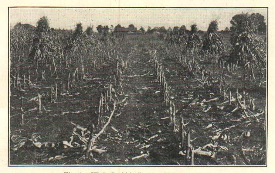
Fig. 1. High Stubble Leaves Many Borers.

Corn borers spend the winter in corn stalks. It is difficult to find the pests in other plants except weeds growing in heavily infested corn fields.