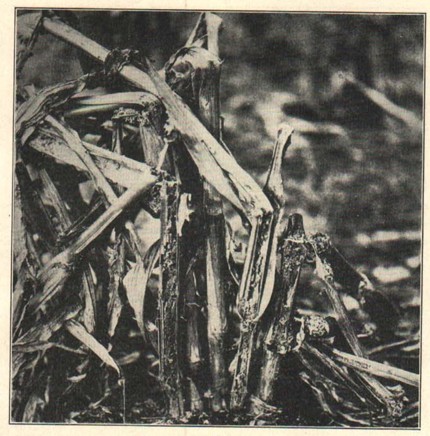
Fig. 4. Borer Damaged Corn.