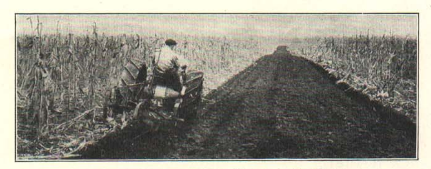
Fig. 3. Wide Bottoms Plow Whole Stalks Cleanly.

A plowed field must be free from surface refuse to kill the borers. Fall plowing when possible is desirable. All control work should be completed by June 1.