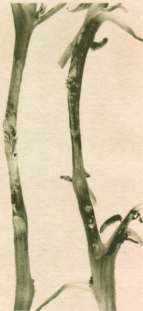
Sclerotinia lesions on potato stems, showing the pinkish-brown ringed margins, and the white fungus growth in the center of the lesion on the left.

Fungicides may be useful in controlling Sclerotinia, but it has not been established that the losses from Sclerotinia justify the cost of additional fungicides.