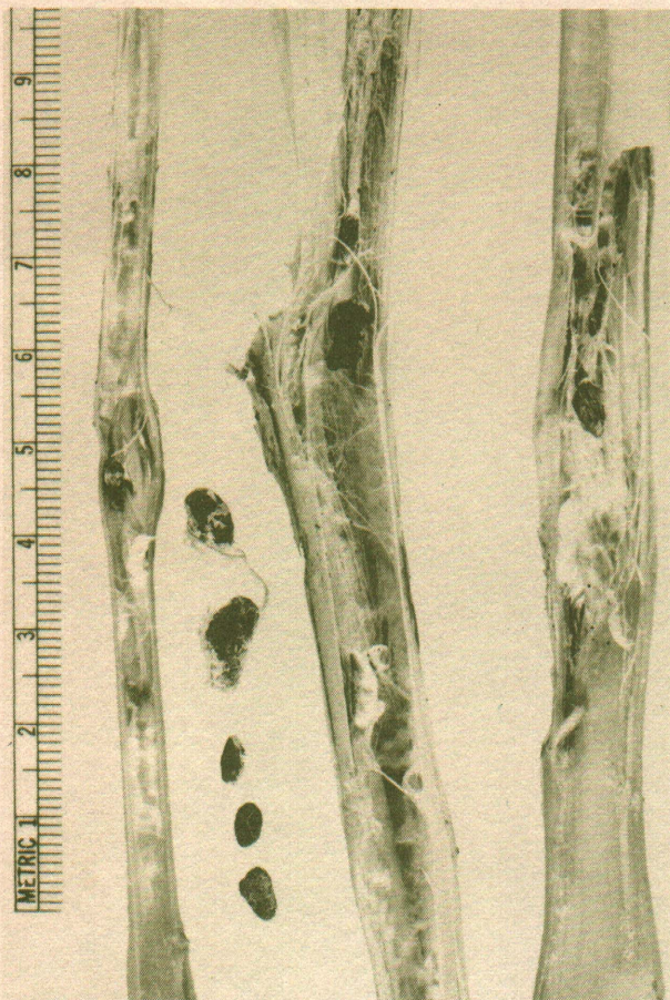
Cavities within the pith of potato stems partially filled with white, cottony fungus growth containing black sclerotia. A few sclerotia have been removed and are shown between the stems. Sclerotia are seldom over \frac{1}{4} inch in length.

Sclerotinia is not usually a disease causing tuber decay in either field or storage. Sclerotinia has been known to attack potato tubers under experimental conditions. When tubers have been infected, invasion was typically through wounds. We have not yet found this phase of the disease in the field.