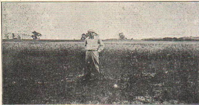
The difference in growth of sweet clover in foreground and background testifies to the importance of supplying plant food not present in soil.

(c) Sugar Factory Lime: This form usually contains from 80 to 85 per cent of carbonate equivalent on a dry basis. In moisture