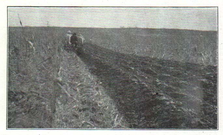
Clean plowing is the most economical way of getting rid of stalks in the corn borer clean up and leaves very little hand picking to be done in order to have a perfectly clean surface in which the borer can find no refuge.

Clean plowing is essential for corn borer control. It is necessary to plow under all stalks, stubble, and trash, leaving a clean surface with no debris exposed after plowing and fitting which might furnish refuge for the borer. Ordinary plowing is not clean enough. Good work can be done, however, except in large standing stalks and long heavy stubble, with plows having a 14 inch width of share if proper adjustments are made and the right attachments are used. Wider plows are