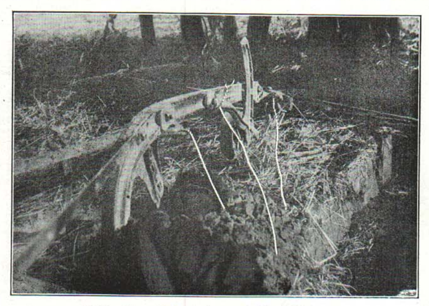
Walking Plow with No. 9 wires attached for holding trash.

The combination rolling coulter and jointer is effective in helping turn under stalks, except when they are heavy or when planted in hills. Rolling coulters cannot be furnished for all walking plows, but, where possible, should be used in the largest size available. The coulter