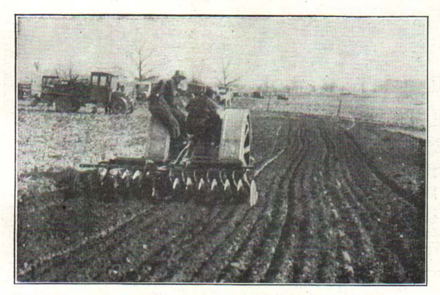
Stubble turned with fourteen inch base plow and followed with corrugated roller and disc.

Where standing stalks or stubble are turned under, some means of compacting the soil following the plow should be used. A cultipacker or roller will compact the soil and press the stubble roots into the ground so that they are not easily brought to the surface in further operations. The cultipacker or roller may be followed with the disc