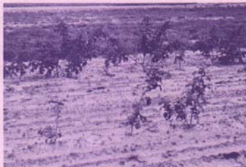
Virus-free red raspberry plants (background) are more vigorous, productive and produce more sucker plants than plants which are not virus-free. Compare to virus-infected plants (foreground).

Spacing of plants in the row and distance between rows depend upon the training system and type of tillage equipment used. Michigan growers use either the hedgerow, hill, or linear system. All three can be used with red and yellow varieties, while black and purple varieties should usually be trained to the linear system.