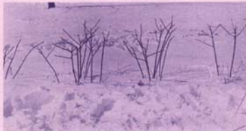
Left—black raspberry plants before pruning. Old fruiting canes were removed after harvest and do not appear here. Tipping in mid summer resulted in development of lateral branches. Right—the same plants after pruning. Laterals were headed back and small, weak canes removed. These raspberries have been trained to the linear system.

on all types of raspberries, except on the fall crop of everbearing types. Remove all suckers growing outside of the hills or rows.