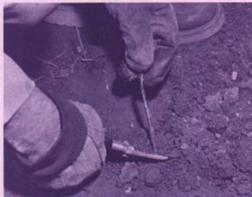
After planting black raspberries, remove old cane (handle) attached to the rooted, layered plant. This will reduce the danger of disease.

Keep plants protected from sunlight and wind during planting. When setting large plantings of raspberries, some growers use forest tree mechanical transplanters.