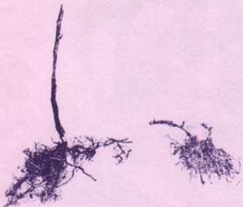
Left—red raspberry plant propagated from sucker plants. Right—black raspberry plant propagated by tip-layering.