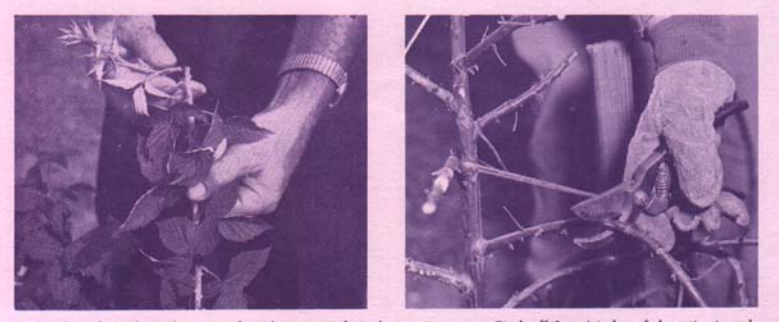
Black and purple raspberry shoots arise from the crown early in the growing season. Pinch off 3 to 4 inches of shoot tips in early summer (left) when they reach the proper height (see text). This causes side branches to develop, increasing the amount of fruiting area. (When pruning in March or April, leave side branches 6 to 8 inches long on black raspberries and 8 to 10 inches long on purple varieties.) Laterals of black and purple raspberries should be headed back during pruning (right). Leave 8 to 10 buds on each lateral.

Allen (mid-season) — plants are reported to be productive, vigorous and hardy. Fruit is large and attractive, and approximately half of the total crop may be harvested in one picking.