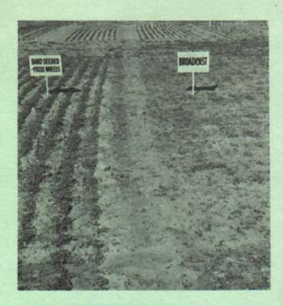
Figure 4. Band seeding followed by compaction resulted in much better stands from early August seedings than when seed was broadcast and the soil cultipacked.

After the first harvest year, fields should be topdressed annually in the fall or early spring with phosphorus and/or potassium. Soil tests made before seeding are the best guides for supplementary fertilization. Annual topdressing with a minimum of