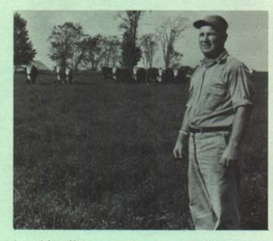
Successful establishment provides 3-8 years of alfalfa-bromegrass instead of unproductive bluegrass or quackgrass.

COOPERATIVE EXTENSION SERVICE MICHIGAN STATE UNIVERSITY