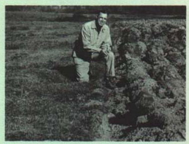
Figure 2. Initial operation in killing grasses can be disking, plowing or field cultivation starting in early June. Subsequent diskings or cultivations should be WEEKLY to kill the grass.