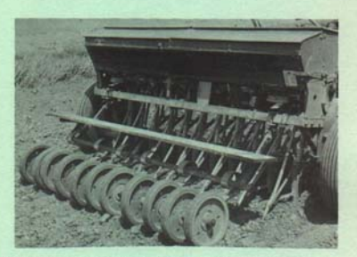
Figure 3. Seeding in early August should be with a band seeder followed by a cultipacker or press wheels to provide compaction for quick emergence and establishment of legume-grass mixture.