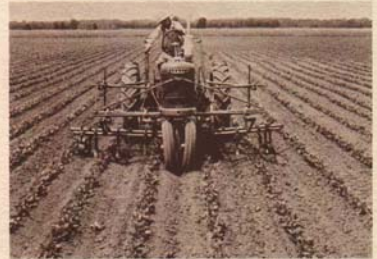
Figure 3. Cultivating beans. Weed control is important in bean production.

An effective and efficient method for control of annual weeds is by use of either pre-planting or pre-emergence herbicides. Use of such herbicides is especially recommended on fields known to have a weed problem. Band application will reduce herbicide costs. Refer to Extension Bulletin #434, "Weed Control in Field Crops," for recommendations.