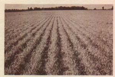
Figure 2. A certified field of bush navy beans in the Thumb of Michigan.

Factors a grower should consider when selecting a bean variety, or varieties, include: (1) plant type, (2) maturity, (3) disease resistance, (4) yield record, and (5) market quality. Seed of five navy bean varieties has been released to growers in the last 8 years by the Michigan Agricultural Experiment Station (Crop Science Department) and the U. S. Department of Agriculture cooperating. Growers with a substantial navy bean acreage probably should plant more than one variety so as to spread the risk of adverse weather at blossom time and to spread the harvest period.