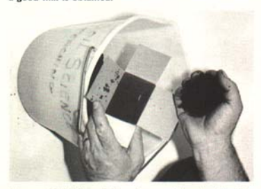
Place a pint of the soil in a clean container for transferring to the soil testing laboratory.