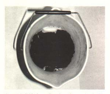
Place 20 individual samplings from the area involved in a clean plastic pail.

Refer to Soil Sampling for No-Till and Conservation Tillage Crops, E-1616 and Till Planting on Ridges, E-1683.