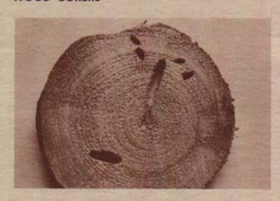
Feeding damage of buprestid (metallic wood-borer) larvae. The tunnels may be as much as ¼ inch or more in diameter. The larval feeding damage of long-horned beetles is similar to the buprestids, but generally larger in diameter and less oval.

Many species of the long horned and metallic wood borers lay eggs in crevices of bark AFTER TREES ARE FELLED BUT BEFORE THEY ARE SAWED INTO LUMBER. The life cycle may be as long as 3 or more years for some species. Because of this, ample time exists for lumber to be used in houses before the grubs pupate and adult beetles emerge.