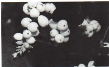
Fig. 46. The waxy white berries of the Common Snowberry contrast beautifully with the dark foliage.

FLOWERS —Small, double, white buttonlike flowers in