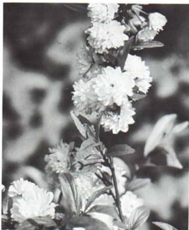
Fig. 31. The pink flowers of the Doublepink Almond Cherry appear early in the spring.

P. o. aureus , the Goldenleaf Common Ninebark, has bright yellow leaves when planted in the sun.