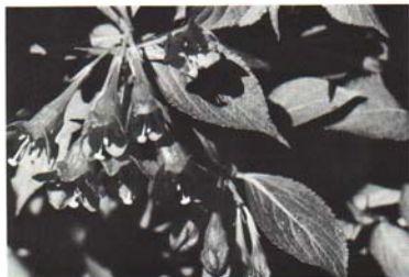
Fig. 55. Weigelas bring color to any garden.

This erect-growing, dense shrub has rather coarse-textured, dark green foliage. The fruit is a two-valved capsule of no ornamental value. It prefers a fertile soil and does best in a protected sunny situation. The branches