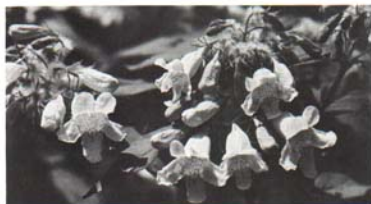
Fig. 23. The Beautybush is covered with small pinkish flowers in late May.

FLOWERS —Pink elongated balloonlike buds that fade to light pink when open. They are lipped like small snapdragons and have golden throats. They are very attractive in early June.