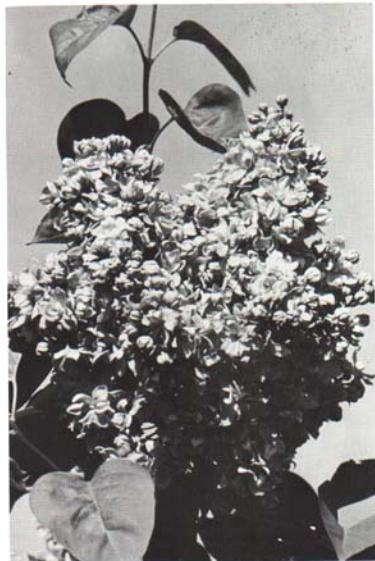
Fig. 49. The Common Lilac, long a favorite in Michigan gardens, is available in a great many varieties.

FLOWERS—Dense, rather broad panicles of lilac-pink flowers appear in early May; this is the earliest of the Lilacs to bloom.