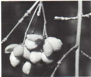
Fig. 16. The brilliant pink, bittersweetlike fruits of the European Burningbush Euonymus persist after the leaves drop.

F. i. Spring Glory , a recent introduction, has deep yellow flowers produced in great profusion.