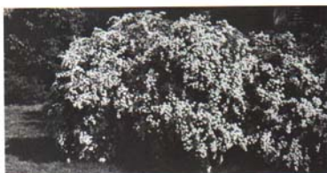
Fig. 45. White flowers in great profusion are the chief attraction of the popular Vanhoutte Spirea.

turns a bronzy-orange in late autumn. These shrubs have fibrous roots and grow in any good garden soil. Use them in front of taller shrubbery, in foundation plantings, and in masses.