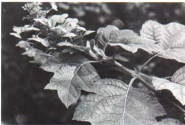
Fig. 22. The leaves of the exotic Oakleaf Hydrangea resemble those of the Red Oak.

This is a dense, well-foliated, narrow, shrubby tree in youth, becoming an open, irregular tree with age. Where it is native in the eastern United States, it will grow to 40 feet high. In Michigan, however, it seldom grows over 20 feet high. It grows best in a light, rich, moist soil that is slightly acid and where it is protected from winter sun and winds. It is valued for its colorful foliage and fruits and is useful as an accent plant or specimen.