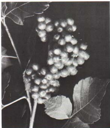
Fig. 36. The Fragrant Sumac with its colorful autumnal foliage and fuzzy red berries grow well, even on gravelly banks.

common and harder to grow, might be valued much more for their beauty.