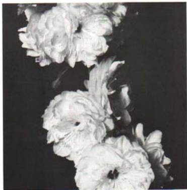
Fig. 33. A popular shrub is the Double Flowering Plum. The pink flowers are effective for nearly 2 weeks.

FLOWERS —White (pinkish in bud), single flowers are in great profusion during late April. It is the first of the Prunus to bloom.