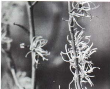
Fig. 18. Witchhazels: first to bloom in the spring ( Hamamelis vernalis ) and last to bloom in the fall ( Hamamelis virginiana ).

FLOWERS—The yellow flowers appear in October, even