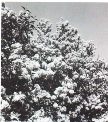
Fig. 48. The Chinese Lilac, with its fragrant lilac-purple flowers, makes an excellent flowering hedge.

FLOWERS —Showy, terminal panicles of fragrant lilac-