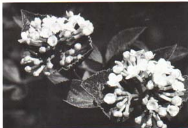
Fig. 51. The Koreanspice Viburnum , with its very fragrant pinkish-white flowers, is a desirable specimen.

FOLIAGE —Coarse, dull green leaves turn a rich, reddish-purple in the fall. One of the best ornamental shrubs for autumnal color.