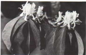
Fig. 25. The honeysuckles are profuse bloomers: the last to flower is the Amur Honeysuckle.

L. maacki is a large, round-headed shrub that becomes