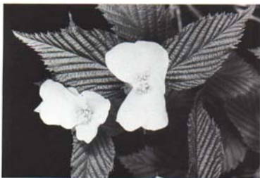
Fig. 35. The white flowers of the Black Jetbead are produced all summer.

The sumacs (often erroneously pronounced "Shoemac") comprise a varied group of plants, two of which are poisonous; the others are good ornamental shrubs. They also vary from creeping vines to tall trees. Almost all of them have colorful reddish fruits (except the poison-