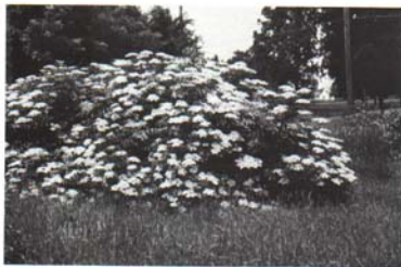
Fig. 42. The American Elder, a common native shrub of Michigan, does extremely well in moist soils.

tember and October. They are eaten by birds and are also used for making pies and wines.