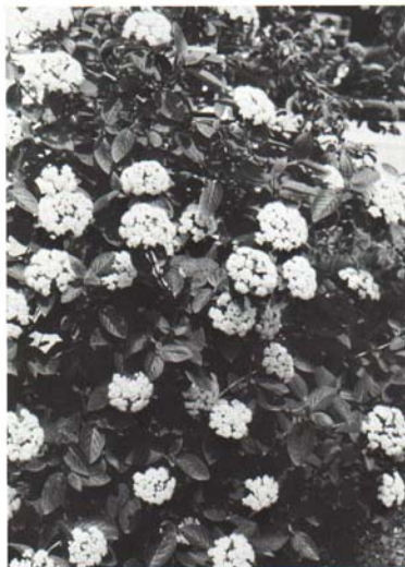
Fig. 52. A worthy addition to any garden is the Wayfaringtree Viburnum . Colorful in flower, fruit and foliage, it grows well in almost any situation.

Another native viburnum that is a large, erect, open-growing shrub, it does well in even rather difficult situations of shade and dry soil. The blue-black, bloomy ber-