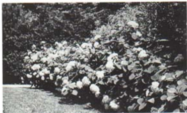
Fig. 20. The Snowhill Hydrangea makes an excellent low plant for shady locations.

in early July. They are greenish at first, then turn white and finally tan, remaining on the stalks long after the leaves drop in the fall.