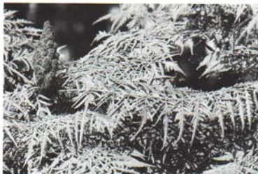
Fig. 38. The Cutleaf Staghorn Sumac has deeply cut, fine-textured foliage.

shrub, also spreads by suckering roots. In native plantings found along the roadsides and fence rows, one clump may spread out over 100 feet in length. When restricted to a few main trunks, it develops into an open, straggly and often picturesque plant. The foliage is pinnately compound. Bright green during the summer, it turns to red and orange in the autumn. The greenish flowers are in large terminal clusters that bloom in late June. The fruits are loose clusters of reddish, hairy seeds at the tips of the branches which make an attractive display in late summer and most of the winter.