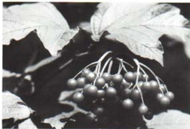
Fig. 53. The scarlet-red berries of the European Cranberrybush Viburnum are colorful from early fall throughout the winter.

ries are in drooping clusters. This species is especially useful as a background shrub and is very effective in woodland margins.