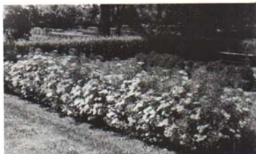
Fig. 44. Anthony Waterer Spirea is used as a flowering hedge in this garden.