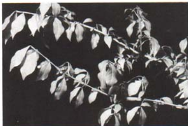
Fig. 15. The corky bark of the Winged Euonymus is especially conspicuous in the winter.