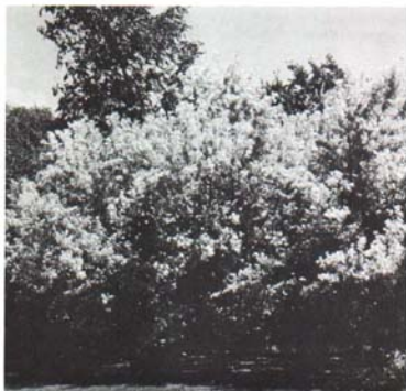
Fig. 14. The silver-gray foliage of the Russian Olive contrasts nicely against other green foliage.

The Winged Euonymus is an erect shrub with a regular outline. Its horizontal branching habit tends to make it broader than high. The greenish flowers are inconspicuous, and the scarlet fruits are mostly hidden by the foliage. It grows in any well-drained soil. This is a good shrub at all seasons but is especially striking in the fall when the foliage colors. It is useful as a specimen, in borders, and as a hedge.