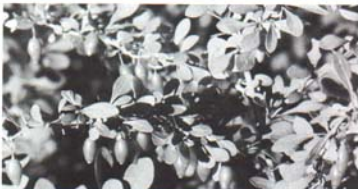
Figs. 2 and 3. The small yellow flowers and attractive red berries of the Japanese Barberry make this versatile shrub a worthy addition to any garden.

throughout the winter and make a colorful display against evergreens or snow. Some strains have more berries than others.