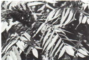
Fig. 37. The Smooth Sumac has mahogany-red fruit heads that persist well into winter.

Another sumac, Rhus trilobata (the Skunkbush Sumac), with similar foliage is often mistaken for the Fragrant Sumac; but its foliage is ill-scented and less hairy, and it has a more upright habit of growth.