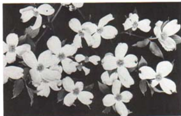
Fig. 8. Few shrubs can surpass the flowering qualities of the Flowering Dogwood.

WINTER TWIGS—Twigs are bright coral-red in the winter. Annual pruning of old dull-colored wood is essential in order to insure good twig color.