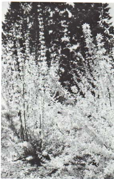
Fig. 17. No color is more welcome in spring than the bright gold of the Forsythias.

F. i. Lynwood Gold is another new variety that has deep golden yellow flowers, also in great profusion.