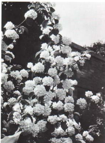
Fig. 54. The Japanese Snowball Viburnum has sterile flowers and is the best of the snowballs.

A large-growing, vigorous, treelike shrub with dense,