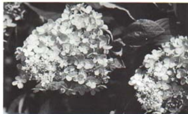
Fig. 21. From green to white to pink and, finally, a dull rose are the flowers of the Paege Hydrangea.

chiefly for its interesting foliage. It prefers a rich, moist soil and a sheltered situation. Because of the odd foliage, it is difficult to combine with other plants and is best when used as a specimen.