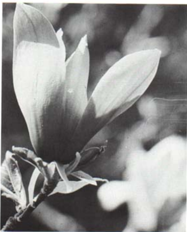
Fig. 27. Few shrubs have more colorful flowers than the Saucer Magnolia.

Another similar Magnolia ( M. liliiflora nigra ) has flowers that are light purple inside and dark purple outside.