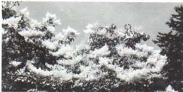
Fig. 47. Last of the lilacs to bloom is the handsome Japanese Tree Lilac.

The lilacs, among our most popular shrubs, are valued for their showy, usually fragrant flowers and their deep