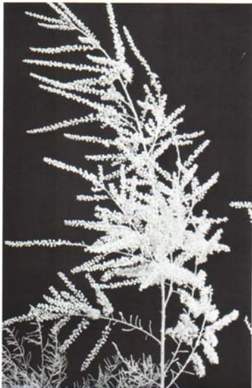
Fig. 50. The flowers of the Tamarix are small, dainty, and pink in color.