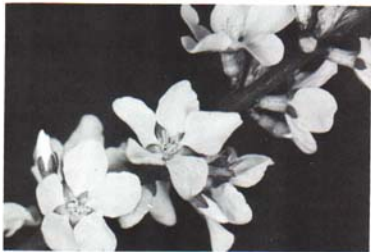
Fig. 32. The first of the Prunus family to bloom in the spring is the Manchu Cherry.

10 ft. Zones 1, 2, 3, 4 MANCHU CHERRY (Nanking Cherry)