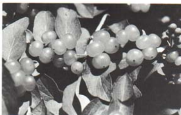
Fig. 26. Birds like to eat the juicy berries of the honeysuckles.

quite open at the base with age. The foliage is bright green and hangs on late in the fall. The hardiest of the honeysuckles, it grows well in any average garden soil in either sun or partial shade. It is used as a tall background shrub in the border plantings, in masses, and as specimens.