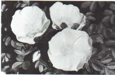
Fig. 39. A good shrub rose with light yellow flowers is the Father Hugo Rose.

During the early summer, the beautiful, fragrant flowers of the roses add much color and interest. For centuries, they have been admired and cultivated in gardens of all lands, and horticulturists have developed so many hybrids