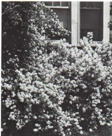
Fig. 13. In late May, the Lemoine Deutzia is covered with clusters of white flowers.

This is a round-headed shrub with rough, pubescent leaves. The twigs are hollow and winterkill badly in Michigan, requiring annual removal of dead wood. This shrub has only the handsome flowers to warrant its use. It prefers a well-drained light soil.