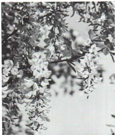
Fig. 24. Yellow peelike flowers of the Scotch Laburnum hanging in pendulous racemes attract much attention in late May.

folium and Ligustrum ovalifolium , this privet has characteristics of both parents. It has the form and foliage much like the California Privet ( Ligustrum ovalifolium ) and is nearly as hardy as the Border Privet ( Ligustrum obtusifolium ). The Ibolium Privet is a very desirable shrub that may be used as a hedge, as a filler in the border, and as a screen plant.