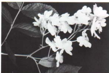
Fig. 40. The popular Japanese Rose has dainty white flowers in clusters.

that it is difficult today to differentiate between some of them. Old, reliable ones are constantly being discarded for newer, better ones. Thousands of varieties are recognized, and some nurseries specialize in growing and selling only roses. Many books have been written on them and there are societies devoted to their culture. Many roses are native to Michigan, growing wild in our meadows and roadsides.