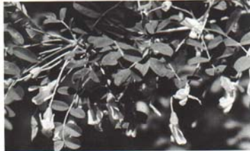
Fig. 5. The Siberian Peashrub is valued chiefly for its ability to grow in dry, sandy soils.

The Siberian Peashrub is an upright-growing shrub or small tree with several main trunks. The fine-textured