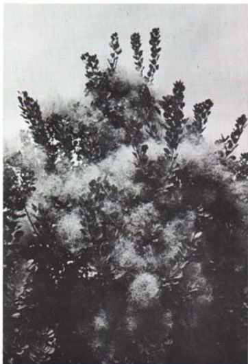
Fig. 10. The Common Smoketree has plumelike fruiting panicles which create a smoky appearance in the summer.

This erect, round-topped shrub makes an excellent hedge, especially in northern Michigan where it is not bothered by San Jose scale. The hardiest of the Cotoneasters, it grows in even poor soils if well drained. Valued for the good foliage, it is used chiefly as a hedge plant in northern areas where the severe winter weather kills the scale insects. Another closely related species, the Glossy Cotoneaster ( C. joveolata ), grows taller and has foliage that turns bright scarlet to orange in autumn.