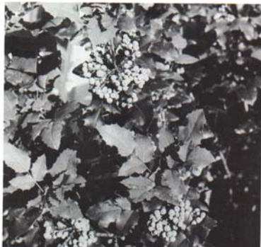
Fig. 28. Glossy hollylike leaves that are nearly evergreen and the glaucous bluish grapelike fruits of the Oregon grape are very attractive in late summer. Grow it in a protected, partially shaded situation for best results.