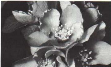
Fig. 6. The applelike blossoms of the Common Floweringquince make this shrub conspicuous in early spring.

This floweringquince is a broad-spreading shrub with