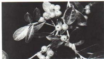
Fig. 1. The bright red berries of the Red Chokeberry are quite showy. The foliage also colors red in the fall.

The barberries are a very useful group of evergreen and deciduous shrubs. Many of the deciduous species, especially the Common Barberry ( Berberis vulgaris ), are host plants for the black stem rust of wheat and other cereals. The United States Department of Agriculture has outlawed these in Michigan and other wheat-growing areas. There are, however, several good deciduous species like the Japanese Barberry ( B. thunbergi ) and the evergreen barberries that are sufficiently