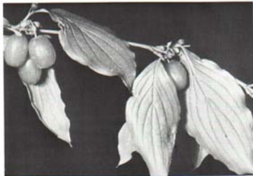
Fig. 9. The red cherrylike fruits of the Corneliancherry Dogwood appear in mid-July. They may be used in making preserves.

This is a broad round-topped shrub that does not sucker and spread as rapidly as the native Red Osier Dogwood ( C. stolonifera ). In addition to being the best red-twigged Dogwood for winter effects, it also has good green foliage which turns reddish in autumn. Flowers are attractive in the spring, and white fruits are showy for a few weeks in the late summer. Although it prefers a moist situation, it does well in any average soil, either in sun or shade.