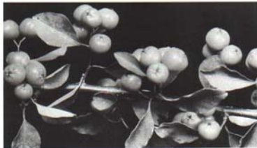
Figs. 11 and 12. The Flowering Cotoneaster is one of the few cotoneasters having both attractive flowers and fruits.

FLOWERS —Attractive double white flowers appear in late June.