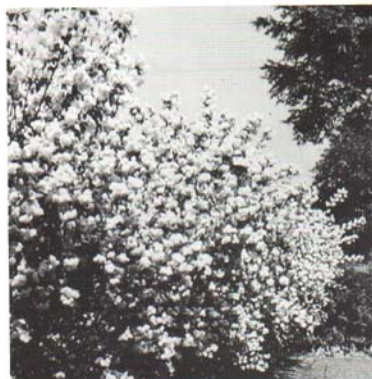
Fig. 29. In mid-June the Virginal Mockorange is covered with fragrant white flowers.

FLOWERS—Fragrant, single white flowers are produced in great profusion; it blooms later in June and over a longer period than P. coronarius .