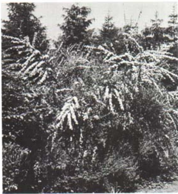
Fig. 4. The lilac-purple flowers of the Fountain Butterflybush cover the outer margin in mid-May.

The Paleleaf Barberry ( Berberis candidula ) is much like the Warty Barberry but is smaller and denser in habit of growth. It is preferred where a low plant under 2 feet in height is desired.