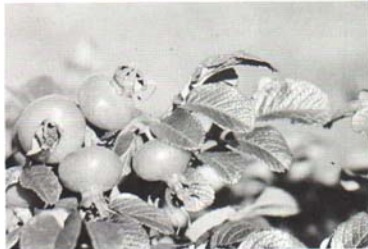
Fig. 41. The orange-red hips of the Rugosa Rose are quite handsome.