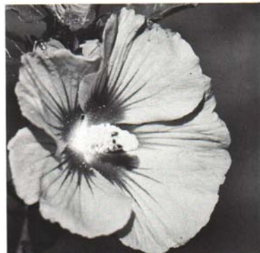
Fig. 19. The large colorful flowers of the Shrubalthea appear in late summer and fall.

FLOWERS —Large clusters of sterile, white flowers appear