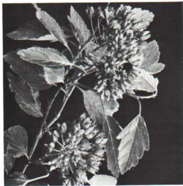
Fig. 30. The fruits of the Common Ninebark are reddish in July.

This hybrid ( P. coronarius x P. microphyllus ) was originated by Victor Lemoine. It is a compact, rounded shrub densely clothed by medium fine-textured foliage. It does well in any average soil and is valued for its showy flowers. It is useful as hedges, masses, and specimens. There are a great many excellent varieties available. A few of the best ones are listed.