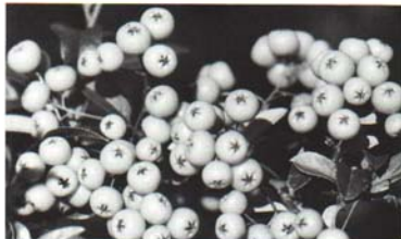
Fig. 34. Few shrubs have more colorful fruits than the Leland Firethorn.

This densely compact erect-growing shrub tends to become widespread with age. The flowers which appear in early May are small, greenish-yellow and not very showy. Fruit is a red berry (on pistillate plants only) but not very ornamental. The USDA recommends planting the staminate plant as it is not susceptible to the white pine blister rust fungus. Growing in any average soil, it is valued for the very early foliage and ability to grow in