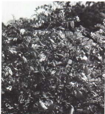
Fig. 7. The yellow flowers and the inflated, bladderlike fruits of the Common Bladdersenna may be seen at the same time.

many thorny branches and dark, glossy green leaves. The new leaves are reddish-bronze when they first appear in the spring. The fruit is a hard, sour, yellowish-green quince about 2½ inches in diameter. It contains pectin and can be used in making jellies. The quinces can be grown in any average well-drained soil. Valued for their showy, early flowers, they are used as hedges, thicket plantings, in borders, and as specimens. Many varieties are available with either single or double flowers, varying from white to pink to deep red. A few of the best varieties are listed.