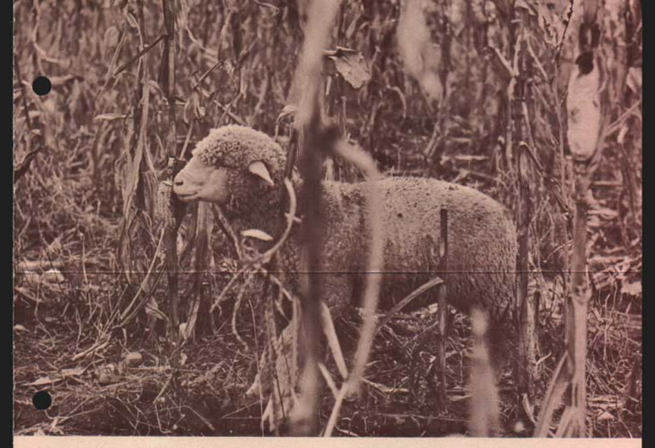
Lambs should be vaccinated for enterotoxemia two times at 10-14 day intervals before turning into the corn field and have plenty of good quality hay or pasture available at all times.

biotics and other feed additives are, however, no substitute for good feeding and management practices.