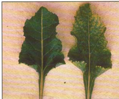
Figure 9. Manganese-deficient sugar beets. Mottling between the veins, right. Chlorosis usually begins on the younger leaves. Severe deficiency causes gray and black specks along the veins.