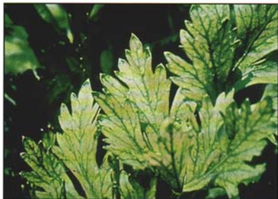
Figure 5. Manganese-deficient celery. Chlorosis of the leaves between the dark veins.