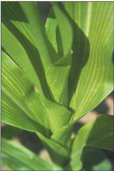
Figure 8. Manganese-deficient corn grown on organic soil. Leaves are light green with yellowish stripes.