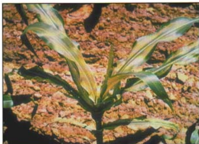
Figure 13. Zinc-deficient corn. Yellow or white striping of the leaves usually developing near the stalk. Plants are often stunted with shortened internodes. Found most often on high pH soils and organic soils.

High soil phosphorus levels have been known to induce zinc deficiency, especially in responsive crops (see Figure 17). For years, the cause of this interaction was suspected to be the formation of an insoluble zinc phosphate, which reduced the concentration of zinc in the soil solution to deficiency levels. Zinc phosphate has since been shown to be soluble in soil and is an acceptable source of zinc when finely ground. High levels of phosphorus in plants have been shown to