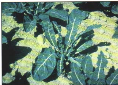
Figure 28. Molybdenum-deficient cauliflower. Yellow mottling between the leaf veins, rolling or curling upward and crinkling of the leaves.