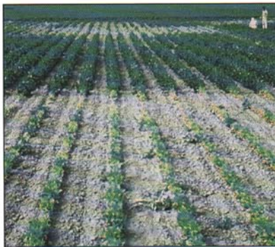
Figure 15. Zinc-deficient dry edible beans, front. Beans in the back received zinc in the starter fertilizer.