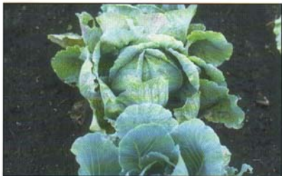
Figure 6. Manganese-deficient cabbage. Interveinal chlorosis of the leaves generally over the entire plant, center. Healthy plant in front.