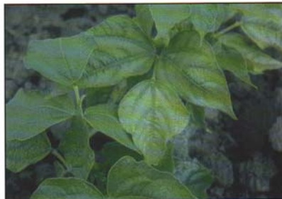
Figure 18. Zinc-deficient dark red kidney beans. Yellow to whitish areas between the darker green veins. Similar to manganese deficiency but dark veins are not as prominent. Leaf size may be distorted and irregular.

tissues when the stalk is split. This is particularly noticeable in the lower nodes.