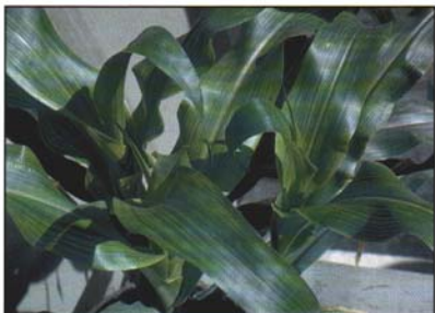
Figure 22. Copper-deficient corn. Development of bluish green leaves and wilting or lack of turgor in the plant. Tips of the leaves later become chlorotic and die under conditions of severe deficiency.

Common carriers of copper are the sulfate and the oxide. Copper sulfate is blue and easily identified in most fertilizers. It has a copper concentration of 22.5 percent. Copper oxide, a brown material, has a copper concentration of 60 to 80 percent. In field tests, this material has been as effective as copper sulfate.