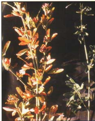
Figure 25. Boron-deficient alfalfa. Shortening of terminal growth and few flowers with yellow to reddish yellow leaves, left. Normal plant, right.

Because boron is fairly mobile in soils, several methods of application can be used. Boron may be mixed with regular N-P-K fertilizer, applied separately on the soil, sprayed on the plant, topdressed (for alfalfa) or sidedressed (for row crops). Be sure to mix completely when boron is combined with other fertilizers. Segregation due to particle size differences is often a problem. Boron should never be used in combination seedings containing legumes and grass or small grains because it will injure the grass or small grains. Boron for the legume should be