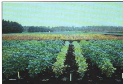
Figure 12. Manganese-deficient soybeans on organic muck soil, center. Caused by a manganese chelate that created iron-manganese imbalance in the plant. The manganese chelate was converted to an iron chelate in the soil after application.

Manganese-deficient corn plants grown on organic soils show light yellow-green pinstriping of the leaves, also described as interveinal chlorosis (Figure 8). Manganese deficiency in field corn has seldom been observed on mineral soils in Michigan.