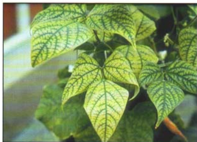
Figure 4. Manganese-deficient dark red kidney beans. Yellowing between the leaf veins. Veins remain green.