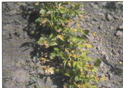
Figure 16. Zinc-deficiency dry edible beans. Pale green leaves, yellow near the tips and outer edges at or soon after emergence. Leaves later become dwarfed or deformed and die. Plants are slow to mature.

sunscauld (Figures 15, 16 and 18). On zinc-deficient plants, the terminal blossoms set pods that drop off, delaying maturity.