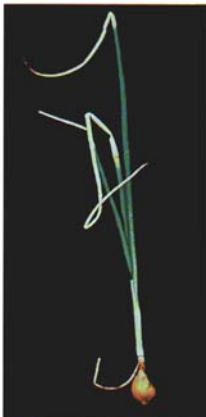
Figure 20. Copper-deficient onion. Tip dieback of the tops. Poor pigmentation of the bulb.

Application rates for organic soils based on soil tests are given in MSU Extension Bulletin E-550B. Rates of copper commonly used in highly responsive crops are 3 to 6 pounds per acre, depending on the soil test level. These rates should be doubled on fields that have never received copper.