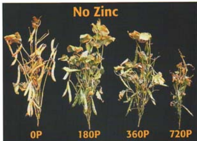
Figure 17. Phosphorus-zinc interaction in dry edible beans. Brownish leaf discoloration, stunted plants and pods fail to develop. Beans above received increasing rates of phosphorus fertilizer without zinc.

Zinc deficiency in corn appears as a yellow striping of the leaves. Areas of the leaf near the stalk may develop a general white to yellow discoloration. In severe deficiency, the plants have shortened internodes and the lower leaves show a reddish or yellowish streak about one-third of the way from the leaf margin (Figures 13, 14). Plants growing in dark sandy or organic soils usually show brown or purple nodal