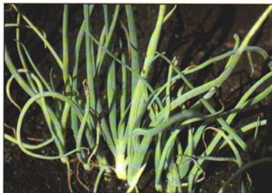
Figure 19. Zinc-deficient onions. Yellow striping, twisting and bending of the tops.

Organic compounds such as zinc chelates (zinc EDTA and zinc NTA) are about five times more effective than inorganic salts with equivalent amounts of zinc. Organic carriers, however, have a lower zinc concentration, ranging from 9 to 14 percent.