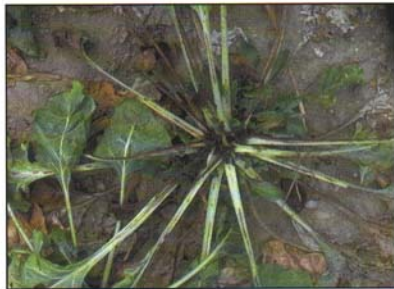
Figure 26. Boron-deficient sugar beets. Advance stage of severe boron deficiency. First symptoms are white, netted chapping of the upper leaves and wilting of tops. Plants later exhibit cross-wise cracking of petioles, death of the growing point and heart rot of the root.

topdressed after the grass has become well established or the small grain companion crop has been harvested. Be careful when banding fertilizers containing boron near the seed or plants. Too much boron near the seed or plant may be toxic to young plants or germinating seeds.