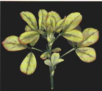
Figure 24. Boron-deficient alfalfa. Yellow to reddish yellow discoloration of the upper leaves. Often confused with leafhopper damage, which also causes yellowing of the tips of leaves.

Crops grown in Michigan show a wide range of response to boron fertilizer (see Table 3). The most responsive crops are alfalfa, cauliflower, celery, table beets and turnips. The boron recommendations for soil applications are 1.5 to 3 pounds for highly responsive crops and 0.5 to 1 pound per acre for medium responsive crops. Occasionally, certain deficient soils may require up to 5 pounds of boron per acre for cauli-