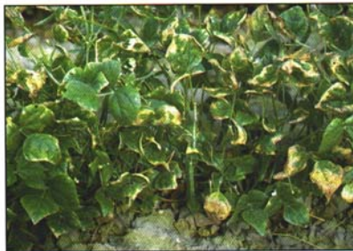
Figure 27. Boron toxicity in navy beans. Yellowing of the leaf tip followed by interveinal chlorosis of the leaves and scorching of the margins.

Plants appear quite tolerant of high soil molybdenum concentrations. There is no record of molybdenum toxicity under field conditions. In greenhouse studies, tomato leaves turned golden-yellow and cauliflower seedlings turned purple. Animals fed foliage high in molybdenum may need supplemental copper to counteract the molybdenum.