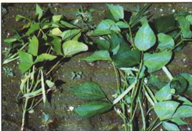
Figure 2. Sulfur-deficient dark red kidney beans. Light-green color and reduced growth, left. Resembles nitrogen deficiency. Plants mature early. Normal plant, right.

In soil, sulfur is present primarily in the organic form, which becomes available when organic matter decomposes. The available sulfate ion ( \text{SO}_4^{2-} ) remains in soil solution, much like the nitrate ion ( \text{NO}_3^- ), until it is taken up by the plant. In this form, it is subject to leaching as well as microbial immobilization. In waterlogged soils, it may be reduced to elemental sulfur (S) or other unavailable forms. Fertilizer impurities also contribute to the total supply of available sulfur in soils.