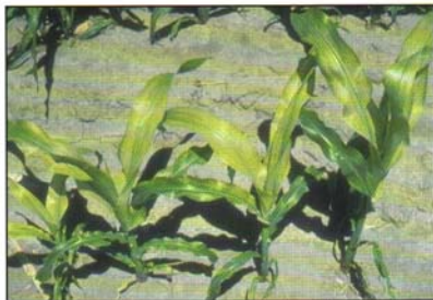
Figure 23. Iron-deficient corn. Light yellowing of the terminal leaves, with interveinal chlorosis of the leaves similar to that caused by manganese deficiency. Seldom found in Michigan field crops. More commonly found in woody plants, ornamental and turf crops.

An unusual form of iron toxicity has been observed in Michigan on organic soils and high organic sands. Some iron-rich, low pH, low manganese soils create an environment in which an interaction between the iron