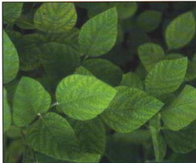
Figure 11. Manganese-deficient soybeans. Symptoms are yellowing between the leaf veins with the veins remaining dark green. Found most often on organic soils and high pH soils.

Most crops deficient in manganese become yellowish to olive-green. Potatoes show reduced leaf size. Grain crops have a soft, limber growth, which often appears diseased. In oats, this may be described as "gray specks." Wheat and barley often show colorless spots.