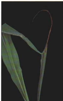
Figure 21. Copper-deficient Sudangrass. Wilting and eventual death of the leaf tips. Symptoms may resemble frost damage.