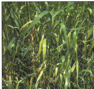
Figure 10. Manganese-deficient wheat. Leaves are discolored and yellowish and may resemble diseased leaves. Found most often on high pH soils.