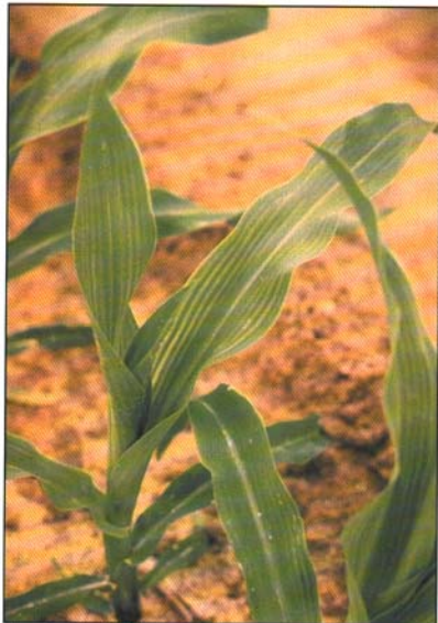
Figure 3. Sulfur-deficient corn. Light green plants growing on sandy soil low in organic matter. Plants usually grow out of the deficiency as the roots penetrate the subsoil.

Because of the many light-colored sandy soils in Michigan, more intensive cropping systems and increased use of fertilizers low in sulfur, one might expect sulfur deficiency to be widespread. Field trials, however, have shown little need for additional sulfur fertilizer. Soil mineral sources and sulfur fallout from the atmosphere currently provide adequate sulfur for crop production in Michigan.