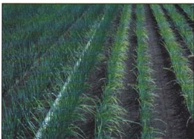
Figure 7. Manganese-deficient onions. Olive green leaves may appear wilted, right. Normal plants were treated with manganese starter fertilizer, left.