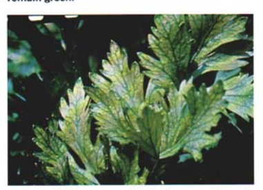
Figure 4. Manganese-deficient celery. Chorosis of the leaves between the dark veins.