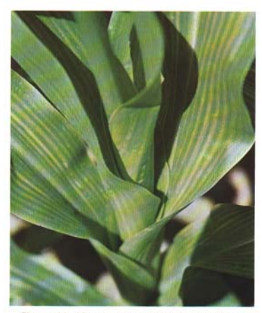
Figure 19. Manganese deficient corn grown on organic soil. Leaves are light green with yellowish stripes.