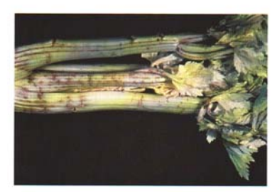
Figure 10. Boron-deficient celery. Also known as "crack stem" because brown cracks develop along the stem rib and later across the stem.