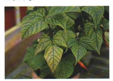
Figure 3. Manganese-deficient dark red kidney beans. Yellowing between the leaf veins. Veins remain green.