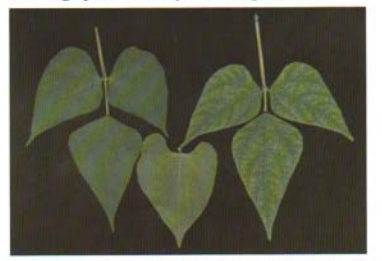
Figure 7. Manganese deficiency in field beans. Yellow mottling between the veins, right. Symptoms occur 3 to 4 weeks after emergence. Normal leaf, left.