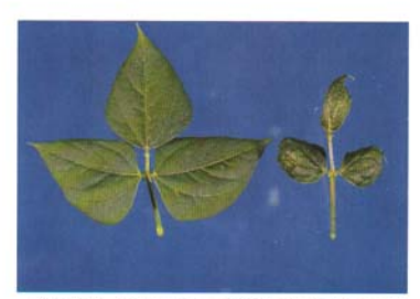
Figure 8. Manganese toxicity in field beans. Scorching of the leaf margins and leaf cupping.