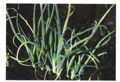
Figure 15. Zinc-deficient onions. Yellow striping, twisting and bending of the tops.