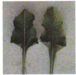
Figure 6. Manganese deficiency in sugar beets. Mottling between the veins, right. Chlorosis usually begins on the younger leaves. Severe deficiency causes gray and black specks along the veins.