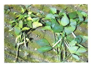
Figure 2. Sulfur-deficient dark red kidney beans. Light-green color and reduced growth, left. Resembles nitrogen deficiency. Plants mature early. Normal plant, right.