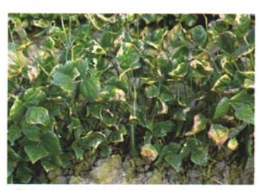
Figure 11. Boron toxicity in navy beans. Yellowing of the leaf tip followed by interveinal chlorosis and scorching of the leaf margins.