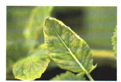
Figure 16. Molybdenum deficiency in cauliflower. Yellow mottling between the leaf veins, rolling or curling upward and crinkling of the leaves. Symptoms resemble nitrogen deficiency.