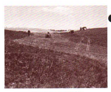
Shape waterways before seeding.

Plenty of plant food is needed to get the grass and a dense sod quickly started. Have the soil tested and apply the needed amount of fertilizer. If a soil test is not possible, apply 500# of 12-12-12 per acre. Topdress each spring with 30# nitrogen per acre. When straw is used as a mulch, add 50 to 100# per acre of ammonium nitrate in addition to the complete fertilizer.