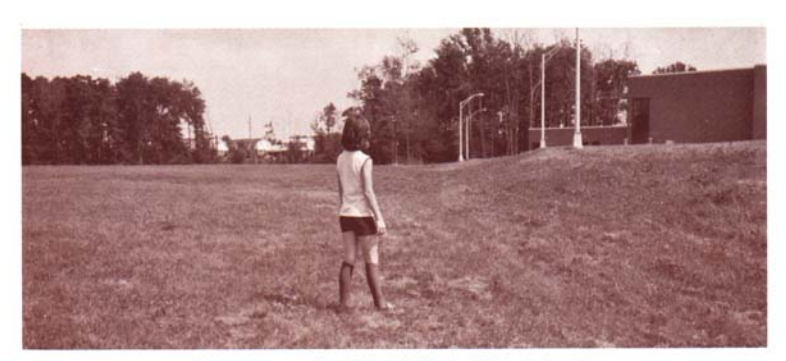
Grass waterways are also needed in industrial and subdivision developments.