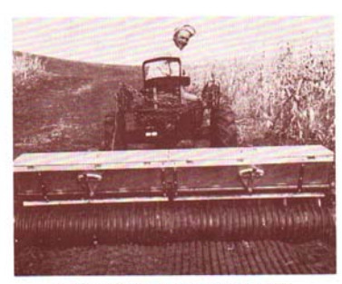
Seed adapted grasses on a well prepared seed bed.

Time of seeding is important—either early spring or preferably late summer seedings are recommended. Make seedings not later than September 15 in the