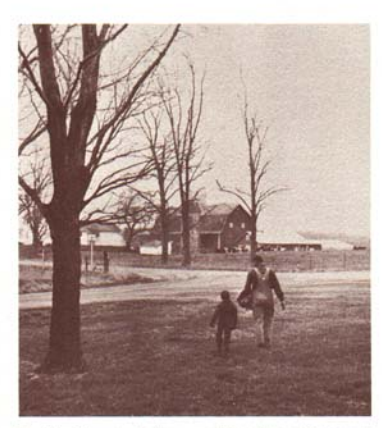
"A lot of farmers I know would enjoy spending some leisure time with their families . . ."

Sometimes Paul has something special to show us: baby cottontails under a brush pile, or a buck deer that grazes with the cattle. These things delight the children, who leap from the back of the pickup at every stop to go bounding around and to explore.