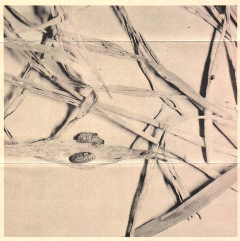
Mature larvae are about 3/16 inch long, hump-backed with brown-black heads and legs, and yellow bodies. The body is usually covered with an "inky" liquid material which gives a dark, slug-like appearance. Larval feeding damage consists of long strips of tissue removed from between the veins of the upper surface of grass leaves. Note the small dark-colored larvae.

control are in progress. Before making a final decision on the insecticide to use for control of the beetle, you may wish to consult your county agricultural extension agent. It is possible that other materials will be registered for this purpose. Also, more information about timing of sprays will be available.