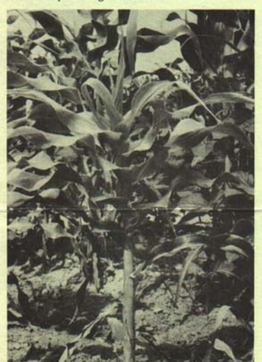
Stunting is another conspicuous symptom of Corn Dwarf Mosaic. The dwarfing may occur along with a red coloration which replaces the striping and mosaicing.

From planting time on is a critical period for young, germinating corn. Cold, wet soils expose the germinating corn kernel to many soil-inhabiting fungi which can cause seed decay and kill the new seedling. Soil temperatures, particularly below 55° F., are favorable for disease development and unfavorable to early corn growth. Before planting, seed should be covered with a protective coating of captan, thiram or other suitable fungicide. Plant hybrids which show greater seedling vigor, particularly under unfavorable weather conditions. Seed should be of high quality, free from cracks. Prompt gernination in a warm, firm moist soil avoids many seedling difficulties.