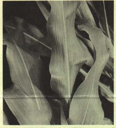
Uniform streaking of leaves, above, which is a symptom of manganese deficiency, should not be confused with Corn Dwarf Mosaic.