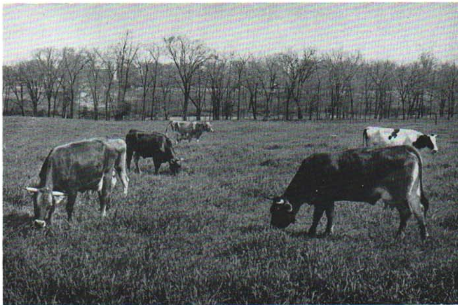
Fig. 3. Fall-sown rye supplies abundant late fall and early spring pasture.