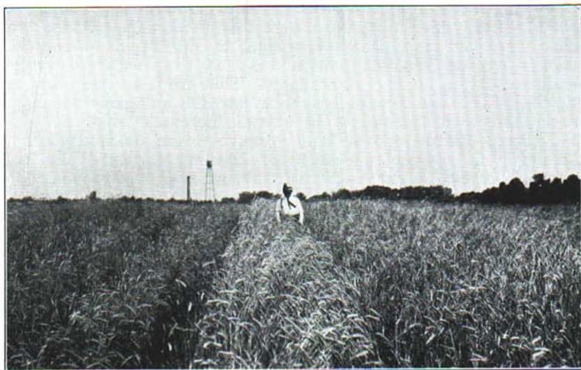
Fig. 1. The center strip of rye and that at the extreme left were planted September 25. Other strips are later October plantings.

The per acre value of rye for grain as reported by Michigan farmers is rather low as compared with that of other grain crops. This fact is not proof of rye's inability to produce well but rather reflects the carelessness of many rye growers in failing to provide growing conditions favorable to a good crop. Rye produces fairly well on soils