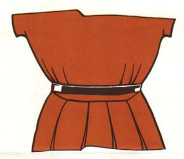
Enough ease over sleeve cap (rounded part) is important to prevent strain and allow comfortable movement.