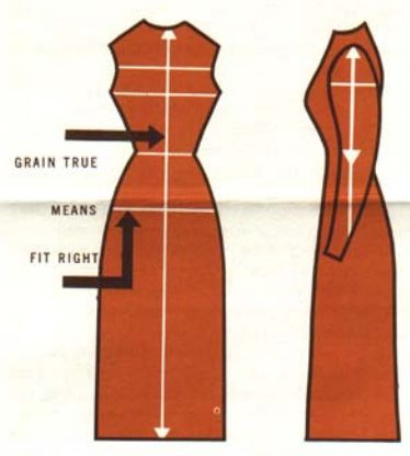
Lengthwise grain perpendicular to floor. Crosswise grain parallel to floor. Grain line placement may vary in a gored or circular skirt, in a kimono or raglan sleeve.

As you look in the mirror, carefully check the following points in relation to the components of fit . They will help you decide the cause and effect of fit.