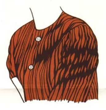
Get to the Bottom of It

Be sure you know WHY wrinkles occur when checking fit. Do they result from: