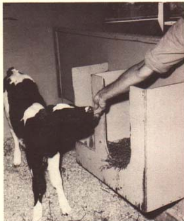
Getting a taste from the fingers. Encourage the calf to eat grain at an early age.

Grass or legume silage or haylage can be offered to calves at any age. The moisture content and quality of the silage will affect the amount they will eat and the growth rate when silage is the only forage