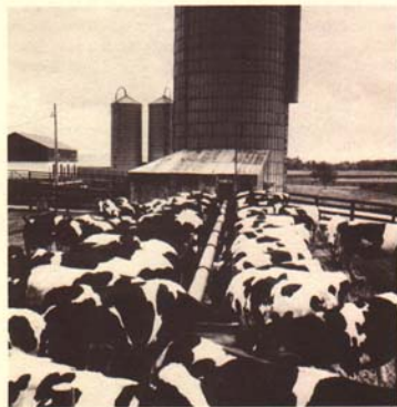
Yearling heifers fed only good quality hay and silage will grow well.

Cobalt deficiency results in lack of appetite and poor growth of young calves. Milk from cows whose diet is deficient in cobalt is low in vitamin B 12 . Trace mineralized salt contains cobalt which is used by bac-