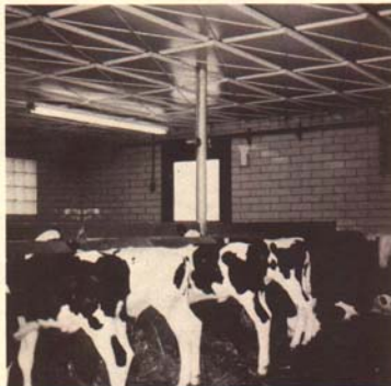
Tie stalls, 2½' wide x 4' long, are desirable in a warm calf-starting barn and reduce the space required per head. Walls and ceilings are insulated.