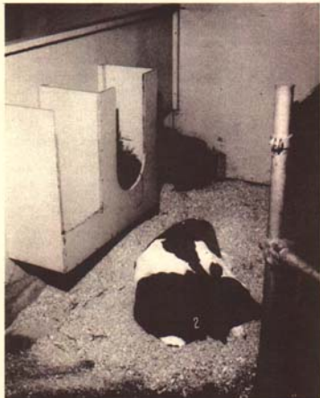
Provide clean, dry pens for newborn calves. Note solid wall between pens, feed box, and water bowl.

In cold weather, dry the calf by rubbing with a clean burlap sack or other dry cloth. Squeeze the material out of the attached navel cord and immediately paint the cord end with 7% tincture of iodine solution to prevent infection. If the navel is hemorrhaging, it may be necessary to tie it off with a clean, disinfected (dip in alcohol) length of cotton or linen thread to prevent the calf from bleeding to death.