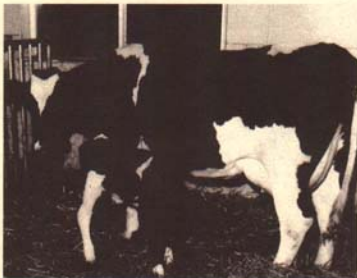
Maternity pen: — clean, well bedded, providing protection for the newborn calf from severe weather exposure.

If disease has been a problem, thoroughly scrub and disinfect the stall. Use a hot, one percent lye solution. You can make it by dissolving a 13-ounce can