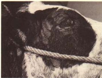
Ringworm can be controlled with good sanitary procedures and veterinary treatment.

of the body area covered with hair. This condition may infect man also. Precautions should be taken to prevent it from spreading to humans.