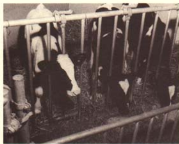
Growing pens can double as maternity pens.

A pole-type barn that is open to the east or south such as a loose housing or free-stall barn can be a satisfactory calf barn. Frequently a section of the barn for older cattle can be arranged as a starting barn for calves. Calves may be tied in 2' x 4' individual stalls, or run loose in pens providing about 20-25 square feet per calf. Individual pens are preferred to minimize the spread of communicable diseases, and prevent calves from sucking each other. Cold pens should have at least three solid sides to prevent drafts through the pen. Pens located near the open side of a barn may need to be partially covered with plywood or other material to prevent snow and rain from blowing on the calves and it also helps to conserve heat on severe days. Heat lamps can be used to protect newborn calves from chilling in severe weather. The barn must be adequately ventilated to allow uniform movement of moisture-laden air from the building. The floor may