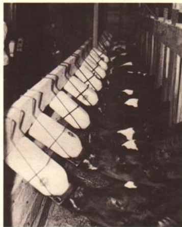
A plastic nipple bottle in a fitted wire holder provides a convenient way to feed calves.

Milk Replacer — Mix one part (by weight) of milk replacer with four parts of water. One cup of replacer weighs about 0.3 lb. Then 3½ cups of milk replacer mixed in two quarts (4.0 lbs.) of water provides the 20% milk solids formula suggested here. This solution is fed at the rate of 0.6% of initial body weight of the calf continuously until weaned.