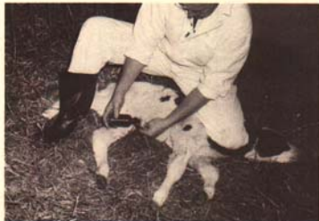
Apply tincture of iodine to the navel to prevent infections.

Enteritis or scours is recognized by a fetid smell, thin watery feces, lack of appetite, depression and loss of weight. Electrolytes, such as bicarbonates, sodium, potassium and chloride, may be lost from the body fluids of calves having severe diarrhea and should be replaced. Loss of these elements disturbs the body chemistry and is probably the major factor in the calf's death in addition to toxin production previously mentioned.