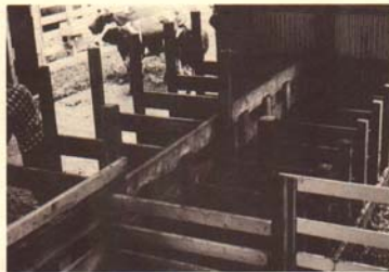
Free stalls can be used for young cattle about 3 months old or older.

The service area is an important part of all calf housing and should contain facilities for: (1) Storage of feed for the calves; (2) Hot and cold water under pressure; (3) Good drain facilities for waste from the washing area and urine; (4) Wash vat for washing and sterilizing calf pails; (5) Storage rack for the clean utensils; (6) A cabinet for storing veterinary supplies.