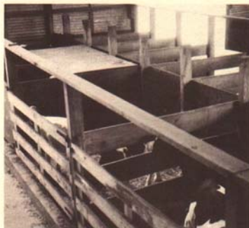
A cold building, free of drafts and dry, makes good housing for small herds.

consist of sand or other coarse material that will allow good drainage.