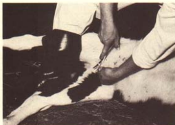
Remove "extra" teats when calves are 4 to 6 weeks old. Use sharp scissors and swab with iodine.

Sucking of the navel, ears, or udder of other calves often occurs, especially in group pens. Individual pens and the feeding of grain immediately following milk will help prevent sucking. Holding calves in stanchions for 15 to 30 minutes after milk feeding may also be successful. Sucking of ears in cold weather