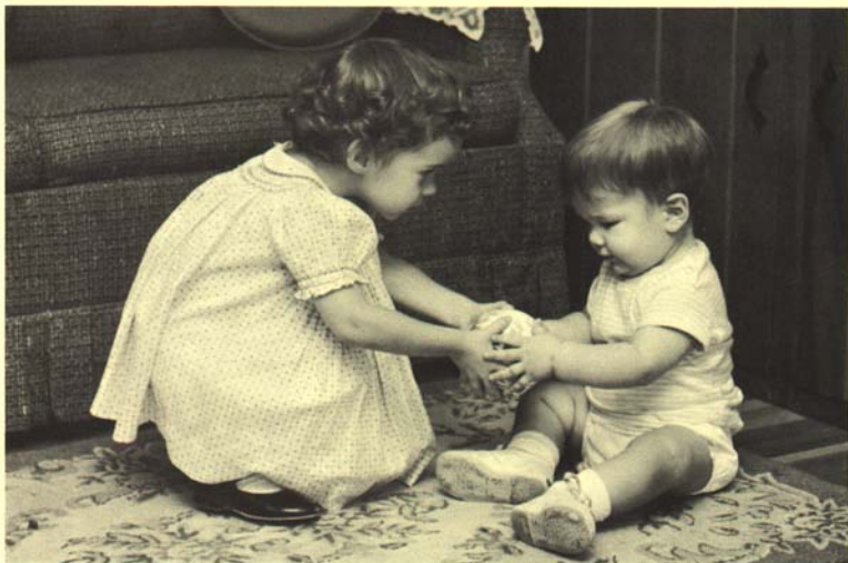
Pre-schoolers experience lending, borrowing, and sharing. Though they are too young to understand money application to these acts, they are developing attitudes toward the underlying principles.

You can teach thrift without introducing the idea of a savings account or a piggy bank. Teach him to take care of his things, to hang up his clothes, to put away his toys, to handle books carefully so they don't get torn. You won't tell your child that he is practicing thrift, of course. It wouldn't mean a thing to him. But that's actually what he is learning when he watches you mend a broken toy instead of throwing it away and buying a new one. When he has to go without a ball for awhile because he lost the one you gave him, he's learning a valuable lesson. Thrift is more than putting cash in the bank, it is conserving the things you own, so they last longer.