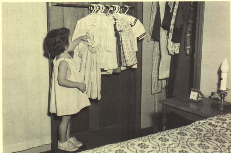
Though too young to understand about thrift she is learning some of its principles by hanging up her clothes and taking care of her things.

of small payments for him two or three times a week. Just as starting to school is something a child knows will happen when he is old enough, so an allowance which he must manage himself can be something for him to anticipate.