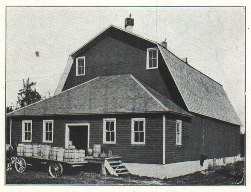
Fig. 1.—This frame storage was built in 1922. It is 40 by 60 feet and has a capacity of 10,000 bushels. A grading room extends across the front. The second floor is used as a storage for empty containers. This is one of the few storages in Michigan with a permanent false floor. A two-inch thickness of hair felt in the walls provides excellent insulation. Note the location of air intakes and outlets.

Conditions most nearly ideal for the storage of apples are to be found only in well constructed cold storage houses, but the costs of construction and operation are too high for the grower or growers' organization with less than 25,000 bushels of late-fall and winter fruits. Unheated cellars and basements have been used for apple storage with varying success. Those provided with openings for the introduction of large quantities of air from the outdoors and with earth floors have been the most successful. These storages, whether they are partly below or entirely above the ground line, are known as common or air-cooled storages.