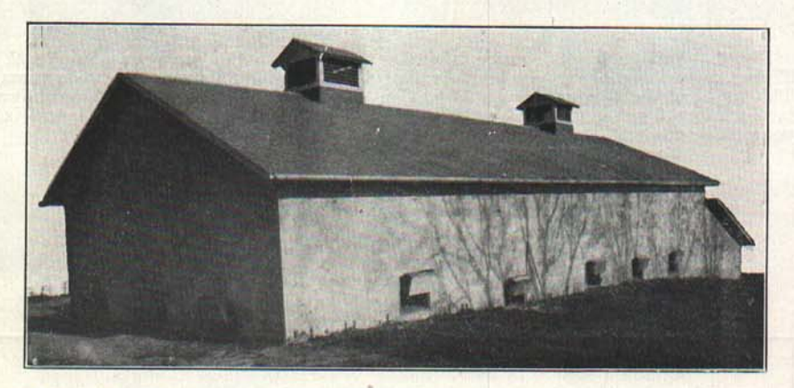
Fig. 3.—The walls of this storage consist of twelve inches of interlocking tile with waterproof plaster on both the inside and outside. It is 33 by 80 feet in size and has a capacity of 12,000 bushels. Hair felt is the principal insulating material of the ceiling. The air intakes are just above the ground line and are well distributed about the building. The air outlets are each 4 by 4½ feet.