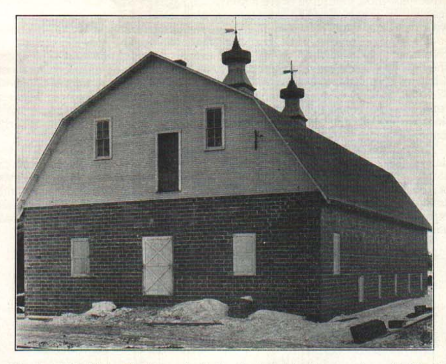
Fig. 4.—This 38 by 70 storage is similar in design to the one shown in Fig. 2. There are two eight-inch glazed tile walls with a two-inch air space between them. The height of the storage room is 14 feet, or about two feet higher than those shown in the other figures. The capacity is about 10,000 bushels. Note the large size ventilating cowls.

This bulletin presents in more condensed form the more important points covered in detail in Special Bulletin, No. 146, of the Michigan Agricultural Experiment Station. A copy may be had upon request.