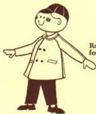
Raglan sleeves allow room for growth