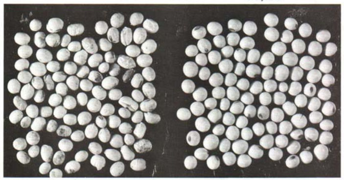
Fig. 2 — Effect of delayed harvest on quality of soybeans. Left—weathered, damaged beans. Right—good quality beans.

REMEMBER: a proper combine setting at 11:00 a.m., may not be correct for 2:00 p.m., of the same day. Figure 3 sovbeans.