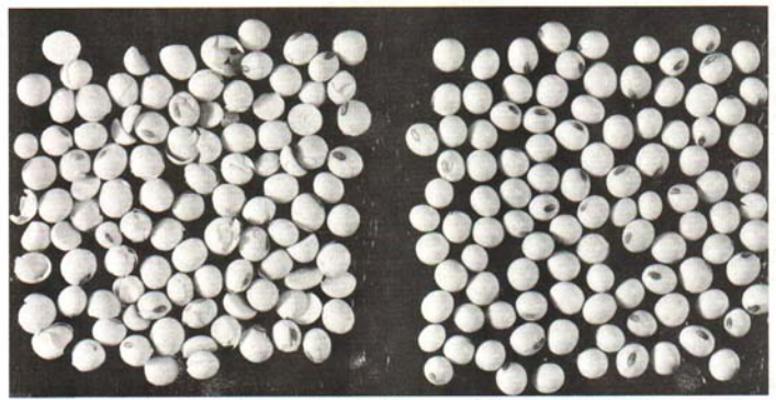
Fig. 3 — Effect of harvesting on the quality of soybeans. Left—poor quality (harvest damage). Right—good quality.

At times during the day the beans may be so dry, or the humidity so low, as to cause excessive cracking or damage. The usual solution is to stop combining during the hottest and driest part of the day.