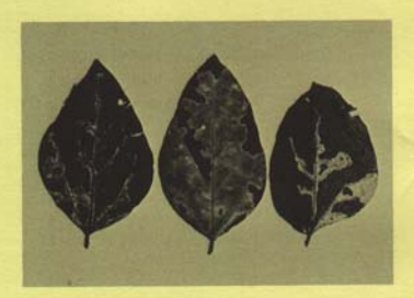
Fig. 8—Brown stem rot of soybeans showing the brownish interveinal leaf discoloration.

Brown spot is a common disease of soybeans in Michigan. It is caused by the fungus Septoria glycines. Typical symptoms are the production of reddishbrown spots on the leaves. With severe infections the