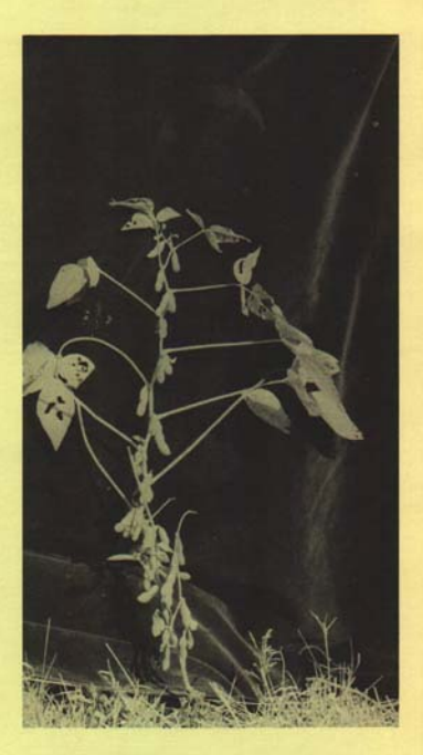
Fig. 2 - Note the distance between ground level and the bottom pods of the tall and short varieties.

The varieties recommended for Michigan vary in maturity from about 105 to 132 days from planting to harvesttime. For the main soybean areas of the state both early and full season varieties are recommended See Table 2.