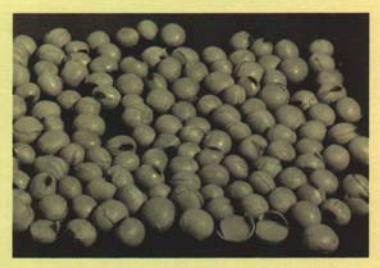
Fig. 3 - Seed quality: Left, sound seed; Right, seed with cracked seed coats.

cannot accurately tell whether good looking seeds will produce healthy plants. Guessing can be costly. High quality seed should have these qualities: