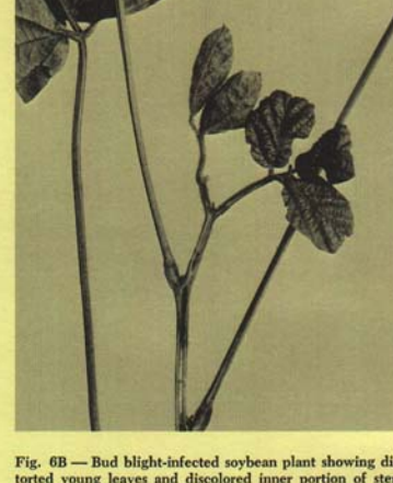
Fig. 6B — Bud blight-infected soybean plant showing distorted young leaves and discolored inner portion of stem at nodes.

virus. Keeping bordering areas free from weeds and other plants that may harbor the virus should help reduce the infection. In southwestern Michigan some serious infections have occurred. In general this area has more fence rows, forage fields, and brushy areas than other production areas. The nematode (Siphinema americanum) can harbor and transmit this disease.