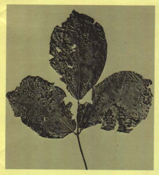
Fig. 7 — Bacterial blight of soybeans showing angular, brownish spots on leaves and shot-holes caused by drop out of dead tissue.

cause the varieties recommended for Michigan are fairly susceptible, it is important that the control practices listed earlier be followed.