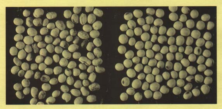
Fig. 4 - Effect of delayed harvest on quality of soybeans. Left-weathered, damaged beans. Right-good quality beans.

and additional adjustments made to solve special problems. Care in threshing is very important in producing seed for planting the next year.