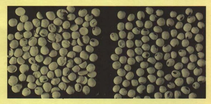
Fig. 5 - Effect of harvesting on the quality of soybeans. Left - poor quality (harvest damage). Right - good quality

A description of soybean insects and control measures may be found in MSU Bulletin E-499, Insect and Nematode Control in Field Beans, Soybeans, and Sugarbeets.