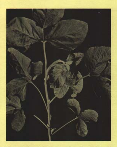
Fig. 6A — Bud blight-infected soybean plant showing distorted terminal leaves curving downward.