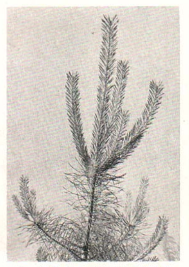
Fig. 6. Scotch pine 3 years after planting, ready for the first shearing.

The shaping and shearing of spruces and firs can be done at any time of year, but best results will be attained if the shearing is done during the period of the year when the tree is dormant. Any time from October 1 on through the winter to April 1.