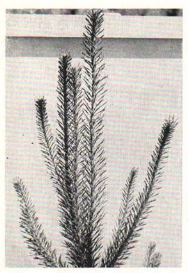
Fig. 4. Scotch pine terminal whorl. Normal development without shearing will give 4 to 7 buds per whorl; thus there will be 4 to 7 branchlets the next growing season. Too much height growth.