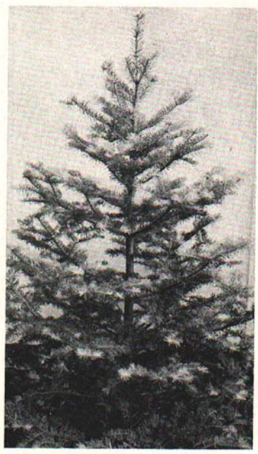
Fig. 18. Same tree as in Fig. 17 after the second shearing.