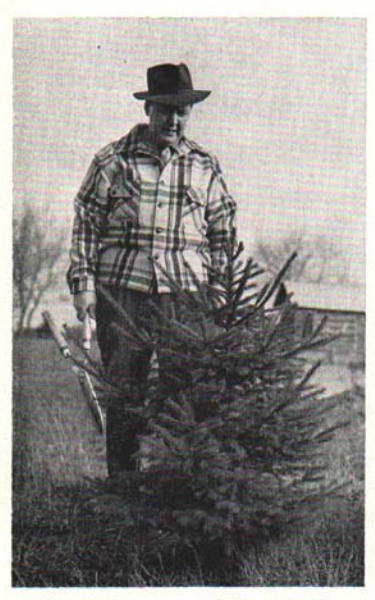
Fig. 11. Spruce tree before shaping; note irregular branch tips.

spring before new growth starts. This can slow the growth of certain branches while others are allowed to grow. The practice can be combined with shearing to form a better shaped tree. However, the practice is too slow and time consuming to be considered practical for the large scale Christmas tree producer.