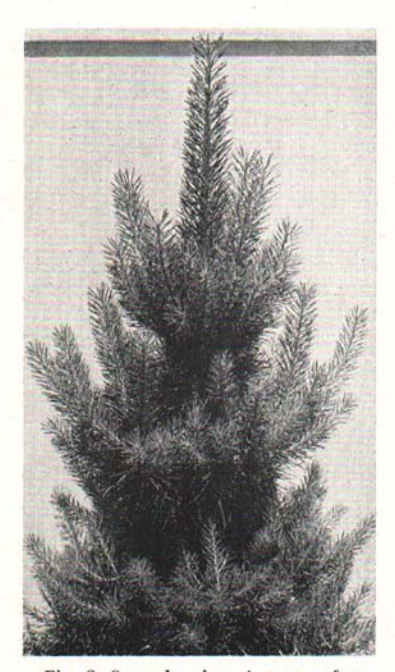
Fig. 8. Scotch pine 4 years after planting showing results of first year's shearing and ready for the second shearing. Note improved shape and density of foliage.

Red and Austrian pine normally grow shorter leaders than Scotch pine, and should not be shorn as heavily as the Scotch pine. Good results can usually be attained by just nipping the tips of the new growth on these species.