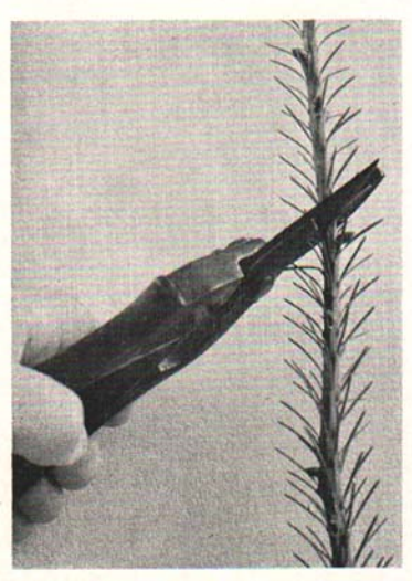
Fig. 10. Terminal leader of Douglas Fir being cut at proper point. Note angle cut, \frac{1}{4} to \frac{3}{8} inch above a good live single bud.

Start shaping by first cutting back the terminal leader to proper length (8 to 12 inches). Make the cut at an angle ¼ to ¾ inch above a good live single bud (see Fig. 10). This bud will then grow and develop into the terminal shoot.