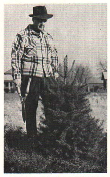
Fig. 13. Douglas fir tree before first shearing showing irregular growth of laterals.

Research workers are currently examining this possibility and may soon have definite information on what kind of shoot moth control we can attain by shearing.