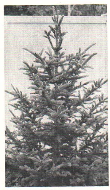
Fig. 15. Wild white spruce sheared the previous season, now ready for second shearing.