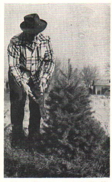
Fig. 14. The same tree as in Fig. 13 after shearing.