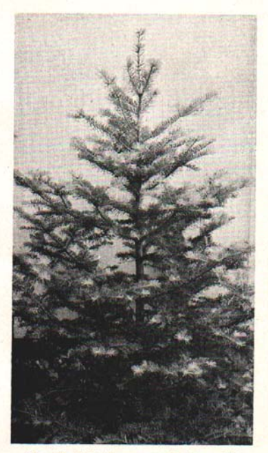
Fig. 17. Wild grown Balsam Fir sheared the previous season now ready for second shearing.