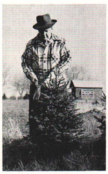
Fig. 12. The same spruce as in Fig. 11 after the first shearing. Terminal cut back and all laterals brought into proper shape.