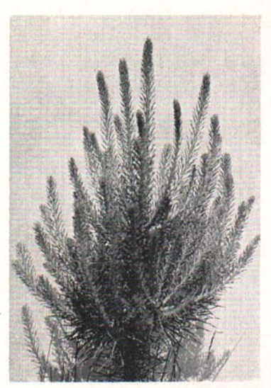
Fig. 5. Scotch pine terminal whorl showing profuse branching stimulated by shearing at proper season. Sixteen to 20 buds and branchlets are not uncommon. Balanced height growth.