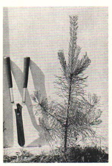
Fig. 7. Same tree as in Fig. 6 after shearing. Note the extra length left on the terminal leader and the improved shape of the tree.