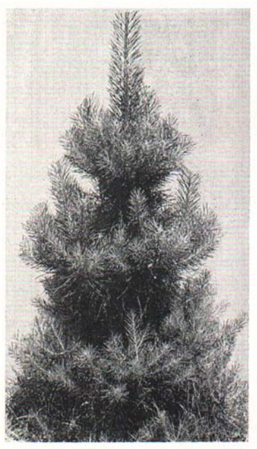
Fig. 9. Same tree as in Fig. 8 after the second shearing. Irregular growth of lateral branches is sheared to line. Main terminal cut longer than laterals on terminal whorl.