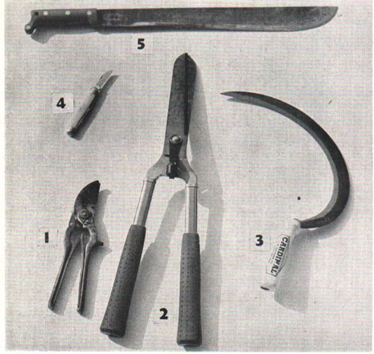
Fig. 3. Tools that may be used for shaping Christmas trees: (1) hand pruners; (2) hedge shears; (3) sickle; (4) pocket knife; (5) machete. Other knives, one-hand sheep shears, or grass shears may also be used (not shown).

Any one of a number of tools may be used (see Fig. 3) from a pocket knife (4) to a machete (5). The pocket knife and hand pruners (1) are considered too slow for large scale operations. The machete (5), corn