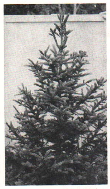
Fig. 16. Same tree as in Fig. 15 after the second year shearing.