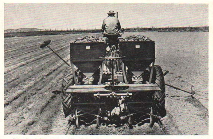
Fig. 5. This picture illustrates the proper adjustment of the covering discs on the planter to avoid covering the seed with too thick a layer of soil.

be wise if you study these carefully. Check on the newer ones by growing them on a small scale before going "all out."