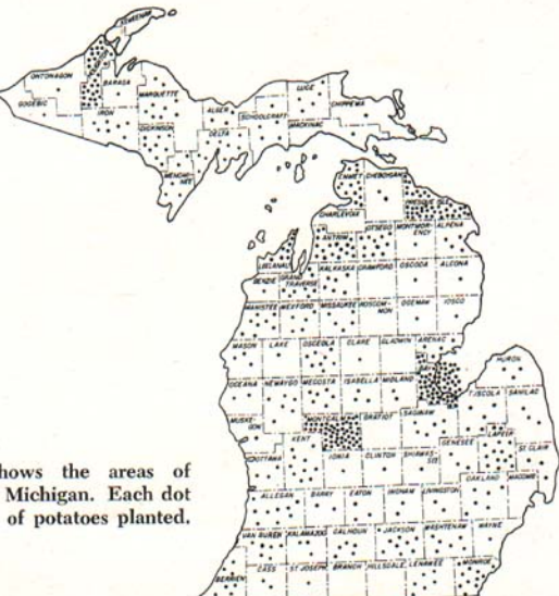
Fig. 2. This shows the areas of potato production in Michigan. Each dot represents 100 acres of potatoes planted.

Changes in production practices, equipment use, and harvesting techniques are likely to continue for some time. Figs. 1 and 2 give details on the present status of potatoes in Michigan, and on crop trends through the years for both Michigan and the United States.