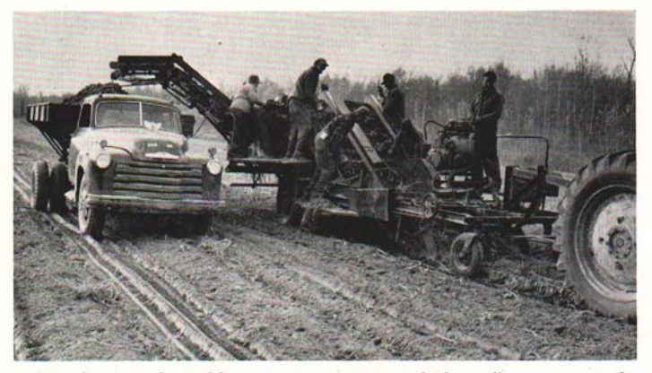
Fig. 9. A mechanical harvester in operation. A fairly small crew operate the machine that does the job of digging and loading into a self unloading box on the truck.

Do not delay the date of harvest. Temperatures below 40° F. will