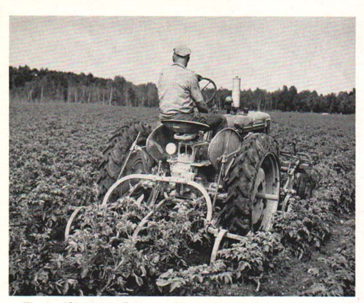
Fig. 6. This picture illustrates cultivation late in the growing season with the teeth of the cultivator operating mainly from the middle of the row.