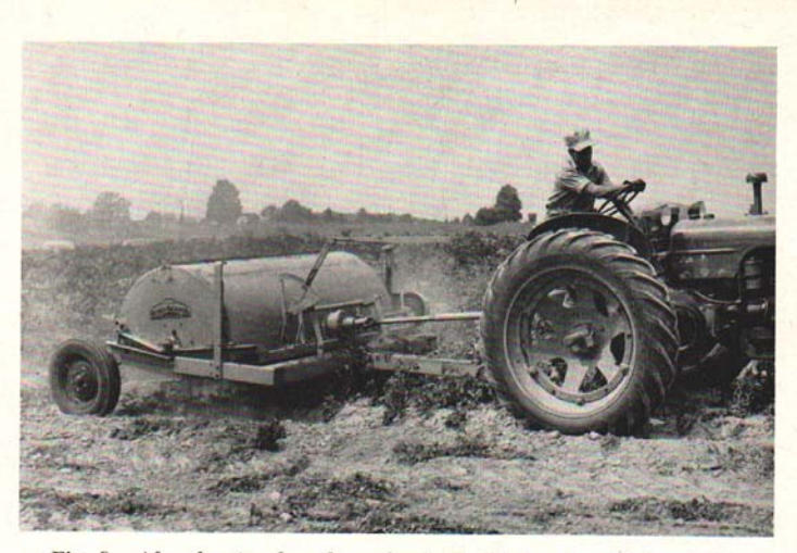
Fig. 8. After the vines have been chemically killed or frosted, the vine beater makes a clean job of the remains for the digger or harvester.

Aldrin was one of the first chemicals to be used for this purpose but it is rapidly being replaced by dieldrin and heptachlor. The volatility of aldrin has caused this switch.