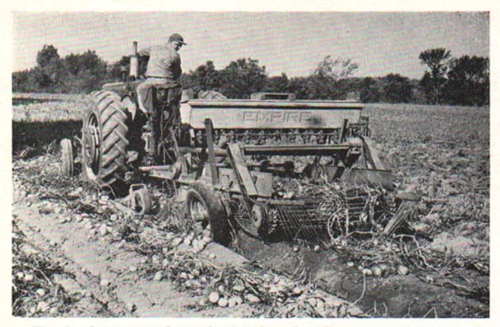
Fig. 4. On potatoes dug early enough in the fall, a rye cover crop may be planted at the same time, by attaching a seeder box to the digger.

nitrogen per acre. This will be 125 to 150 pounds of ammonium nitrate or its equivalent.