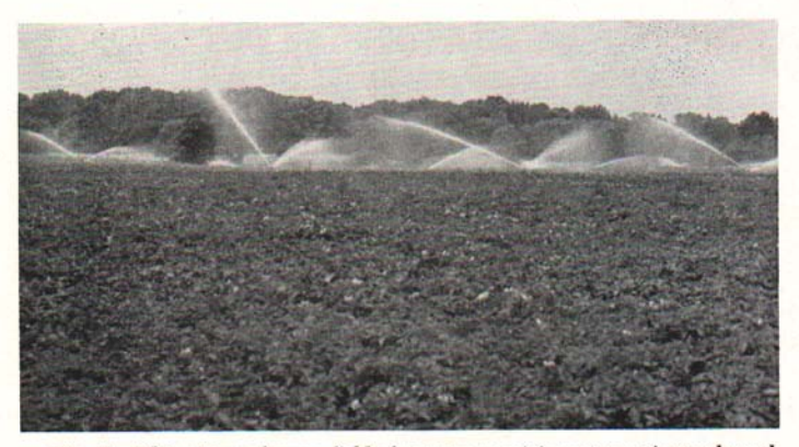
Fig. 7. This picture shows a field of potatoes receiving extra moisture through irrigation at a critical stage of growth where heavy vine growth requires more water.

Some fields, especially old grass sods, may be infested with wire worms or white grubs. Use 3 pounds per acre of the actual dieldrin or heptachlor for sandy or mineral soils. Use 4<sup>1</sup>/<sub>2</sub> pounds per acre for heavier soils, and 6 pounds per acre for muck. Apply these to the soil broadcast with a sprayer, and disc them 3 or 4 inches into the surface.