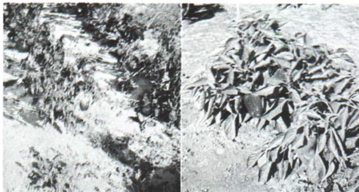
Fig. 3. Results of frost control with sprinkler irrigation. Frost-killed peppers on the left were given no protection. Peppers on the right were protected by continuous water application—and survived a recorded low temperature of 21°F.

Most of the rotary irrigation sprinklers used in Michigan, espe-