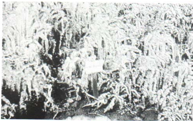
Fig. 1. Continuous sprinkler irrigation formed ice to the thickness of \frac{1}{2} inch on these pepper plants in an experimental plot during a late-fall frost. Yet after the ice was melted, the plants were found to be healthy, vigorous, and undamaged by the freezing temperatures.

Still, clear nights with low temperatures forecast usually indicate possible "radiation" frosts. The weather condition is this: a cold mass of air moves into the area behind a "cold front". Then, if the wind dies down toward evening or during the night and the sky becomes clear, heat is radiated from the plant and the soil to the colder outer atmosphere. The temperature near the ground surface may drop very quickly, as much as 4 degrees in an hour.