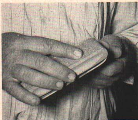
Buffing with sandpaper.