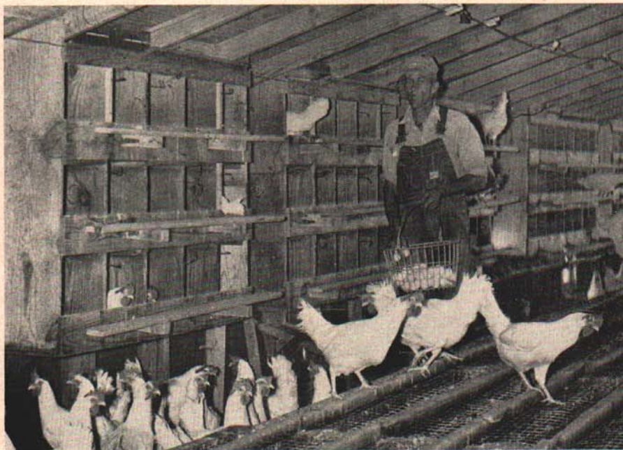
Gather the eggs often to prevent breakage.