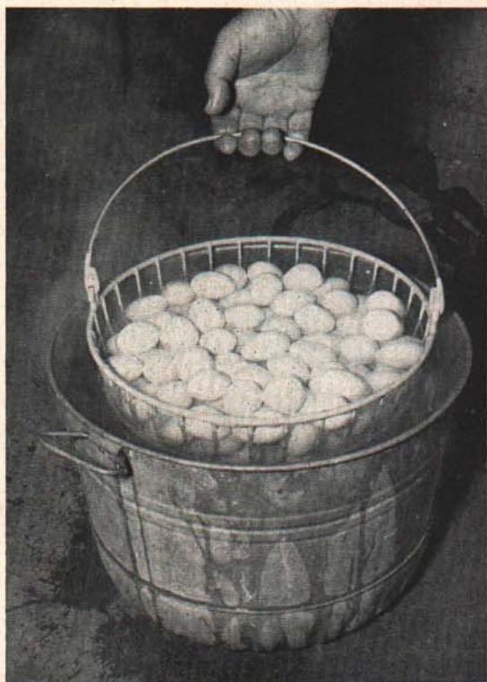
"Soak and Spray"—an inexpensive method of cleaning dirty eggs. STEP ONE: Give the eggs a good soaking in warm water, 3 to 4 minutes.

Several types of dry cleaning machines are available. Most of these machines remove the "bloom", or part of the outer surface of the shells. There is always the possibility that the eggshells may be excessively weakened.